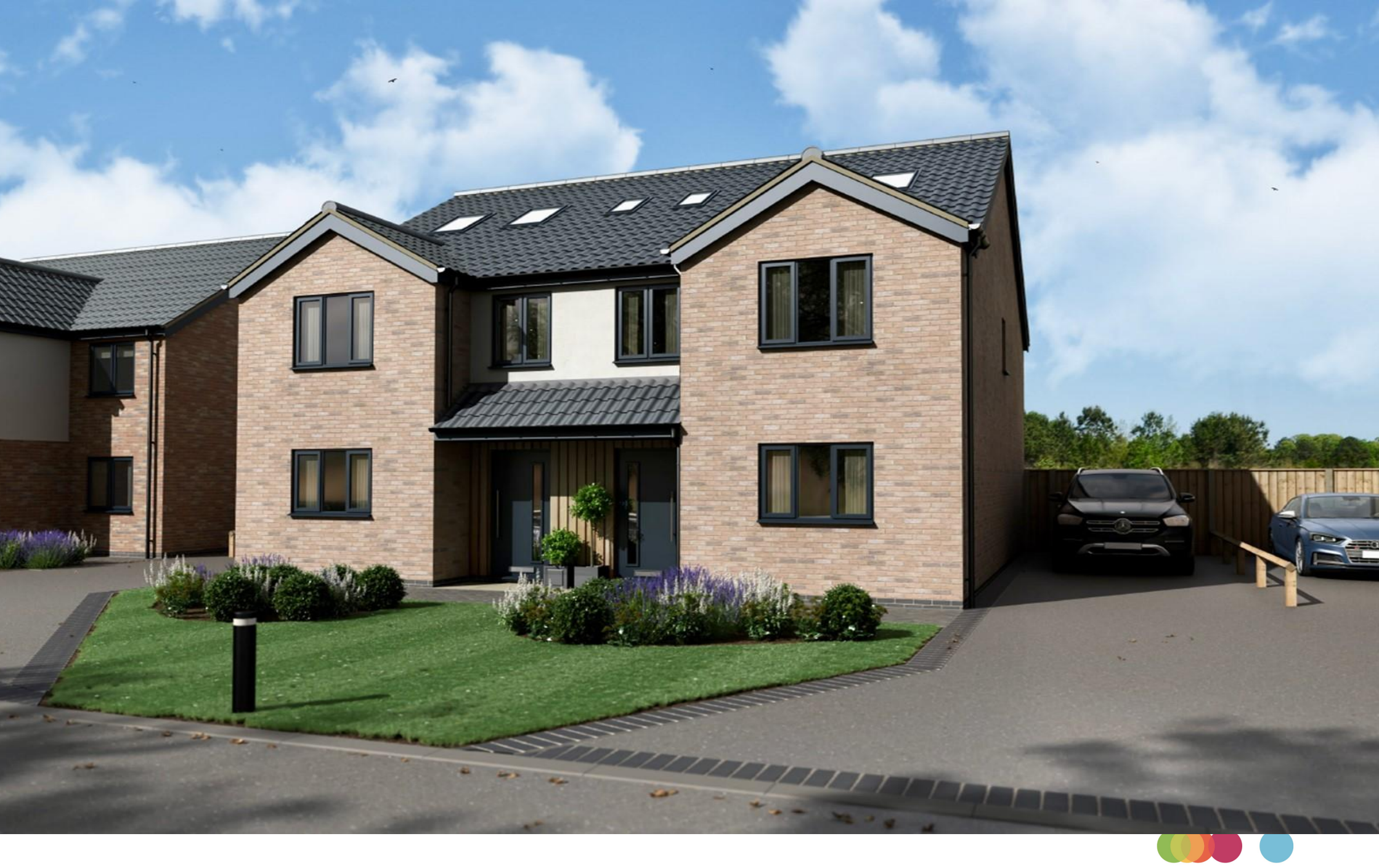
Hope Fields Dunston Road, Metheringham Lincoln LN4 3ED