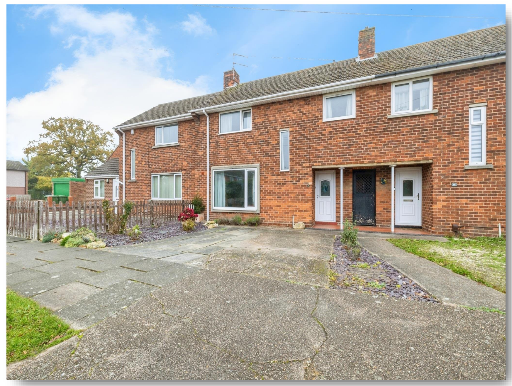
Scotton Drive, Lincoln LN6 0BH