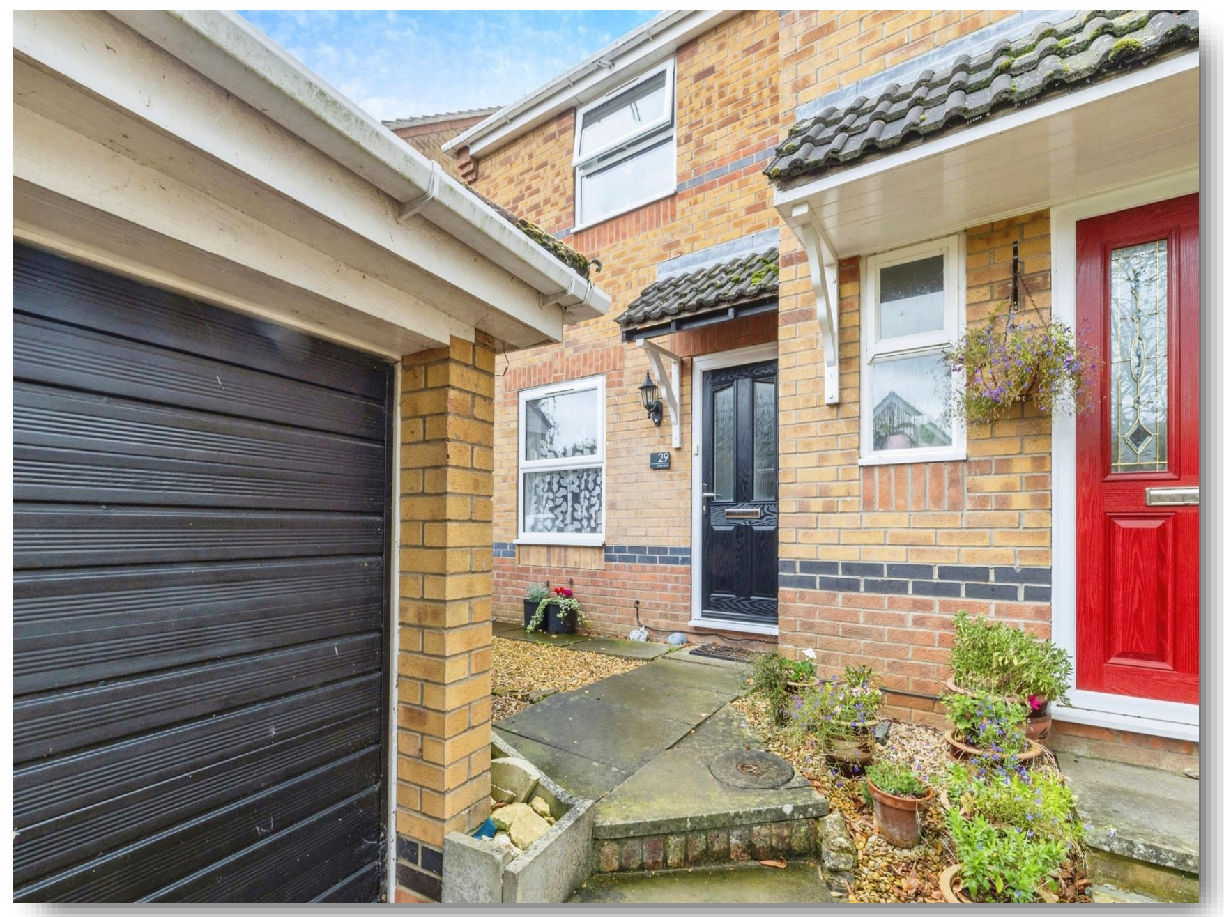
Curtis Drive, Heighington LINCOLN LN4 1GF