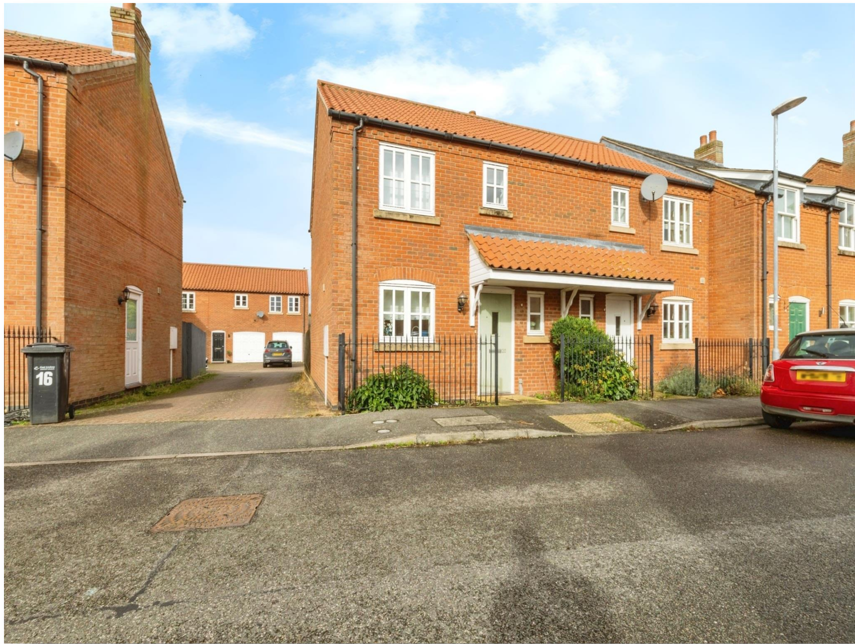
Honeysuckle Lane, Wragby Market Rasen LN8 5AL