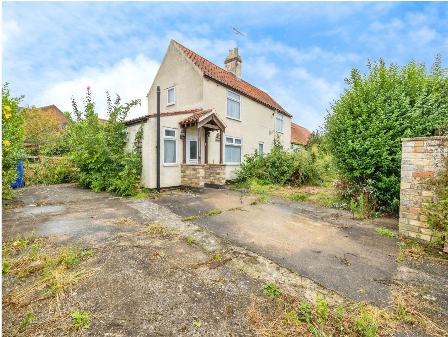
Shetlands End One Nelson Road, Fiskerton Lincoln LN3 4ER