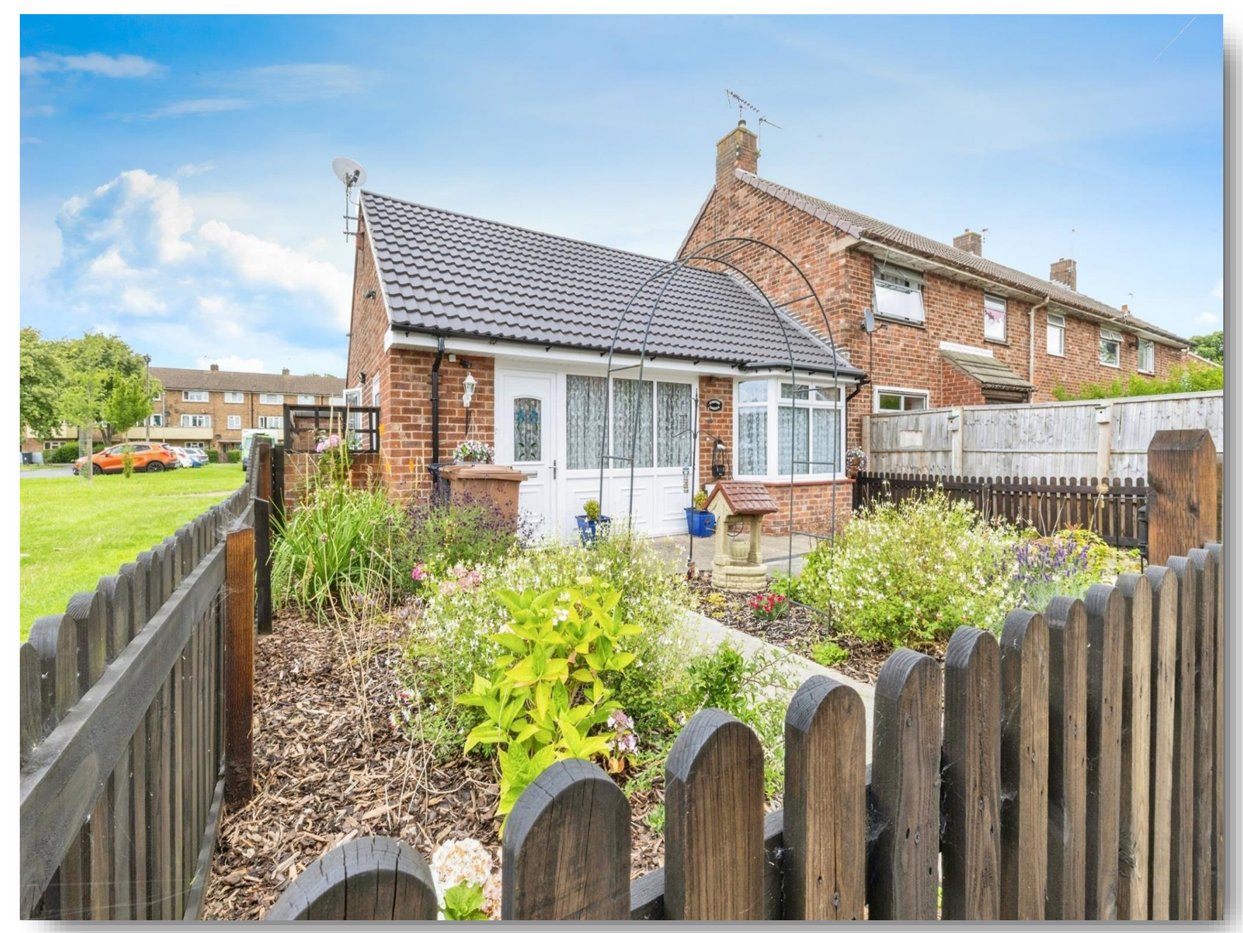
Queen Elizabeth Road, Lincoln LN1 3RG