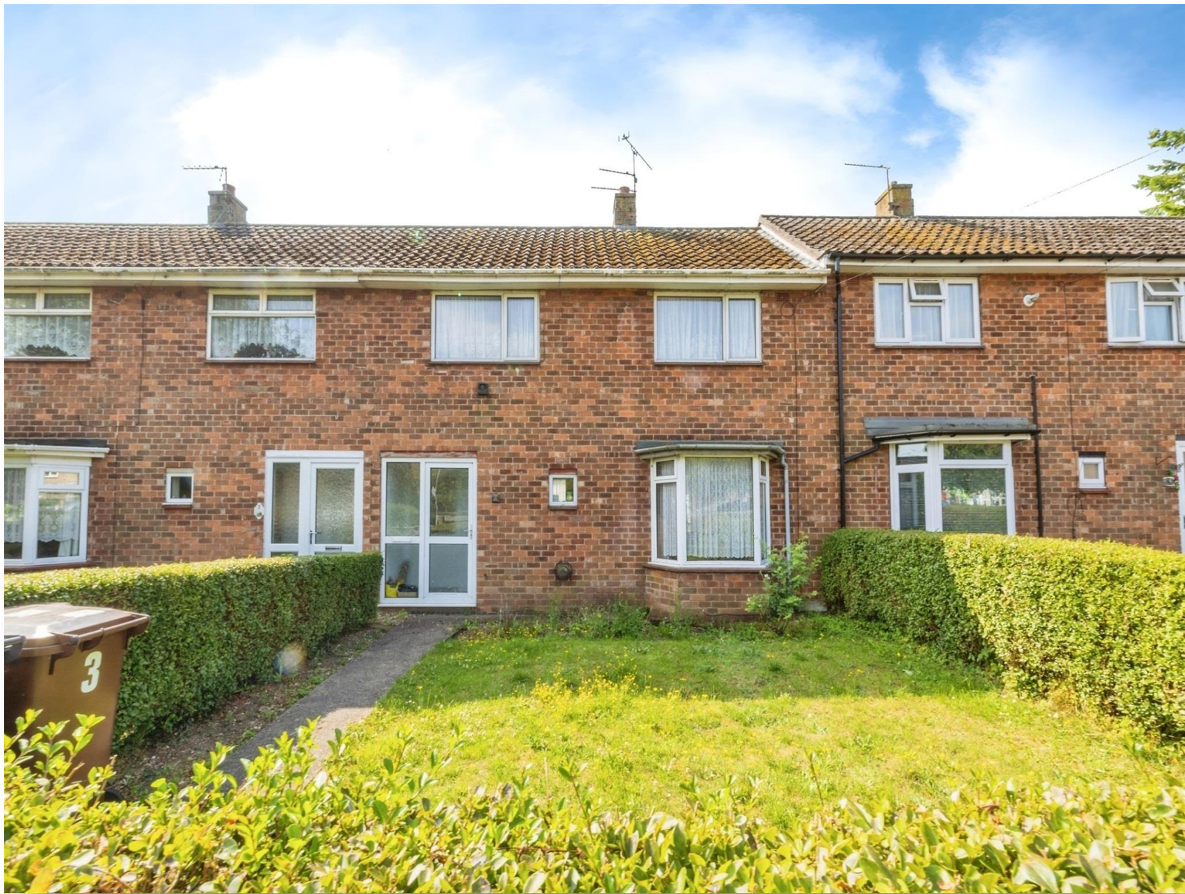
Trelawney Crescent, Lincoln LN1 3PB