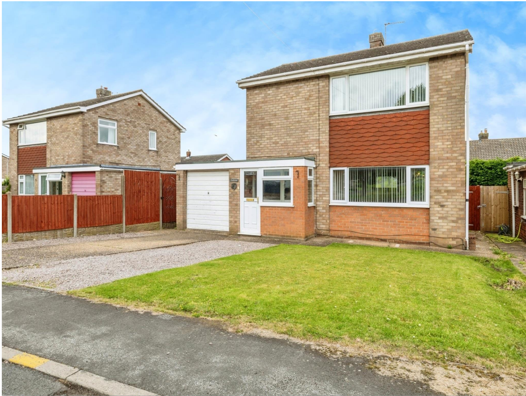
Sutton Close, Washingborough Lincoln LN4 1EZ