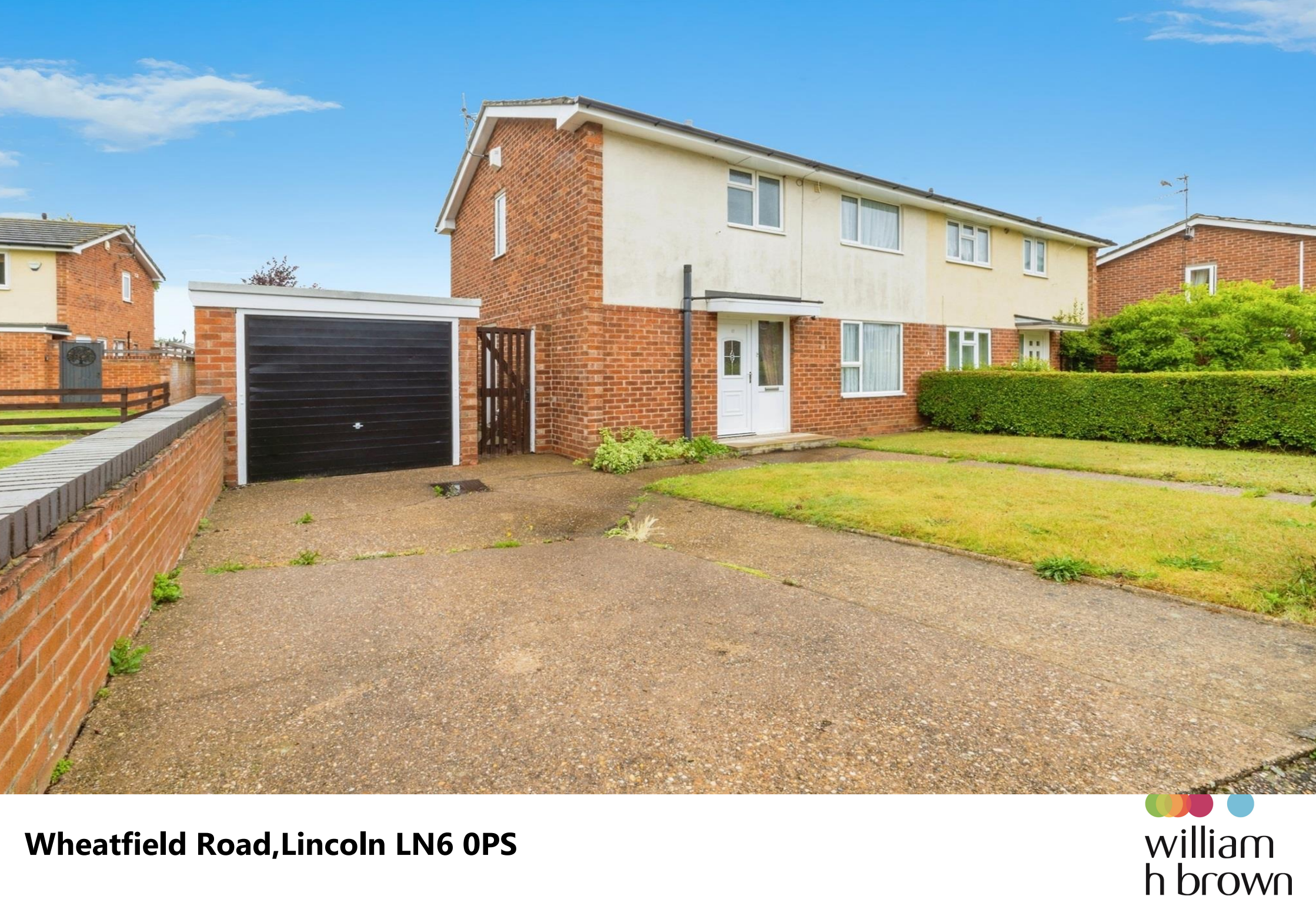
Wheatfield Road, Lincoln LN6 0PS