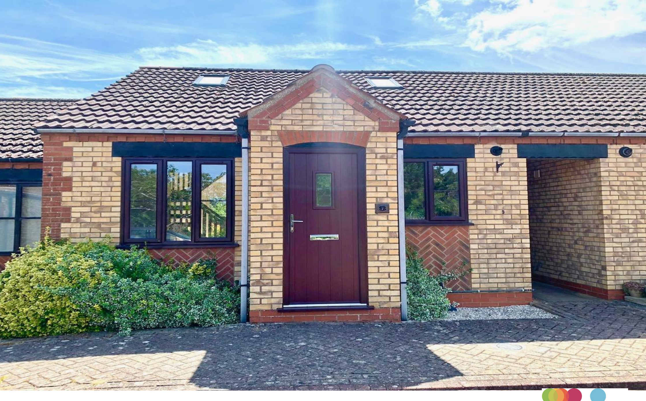
Ridge View, Fillingham Gainsborough DN21 5EB