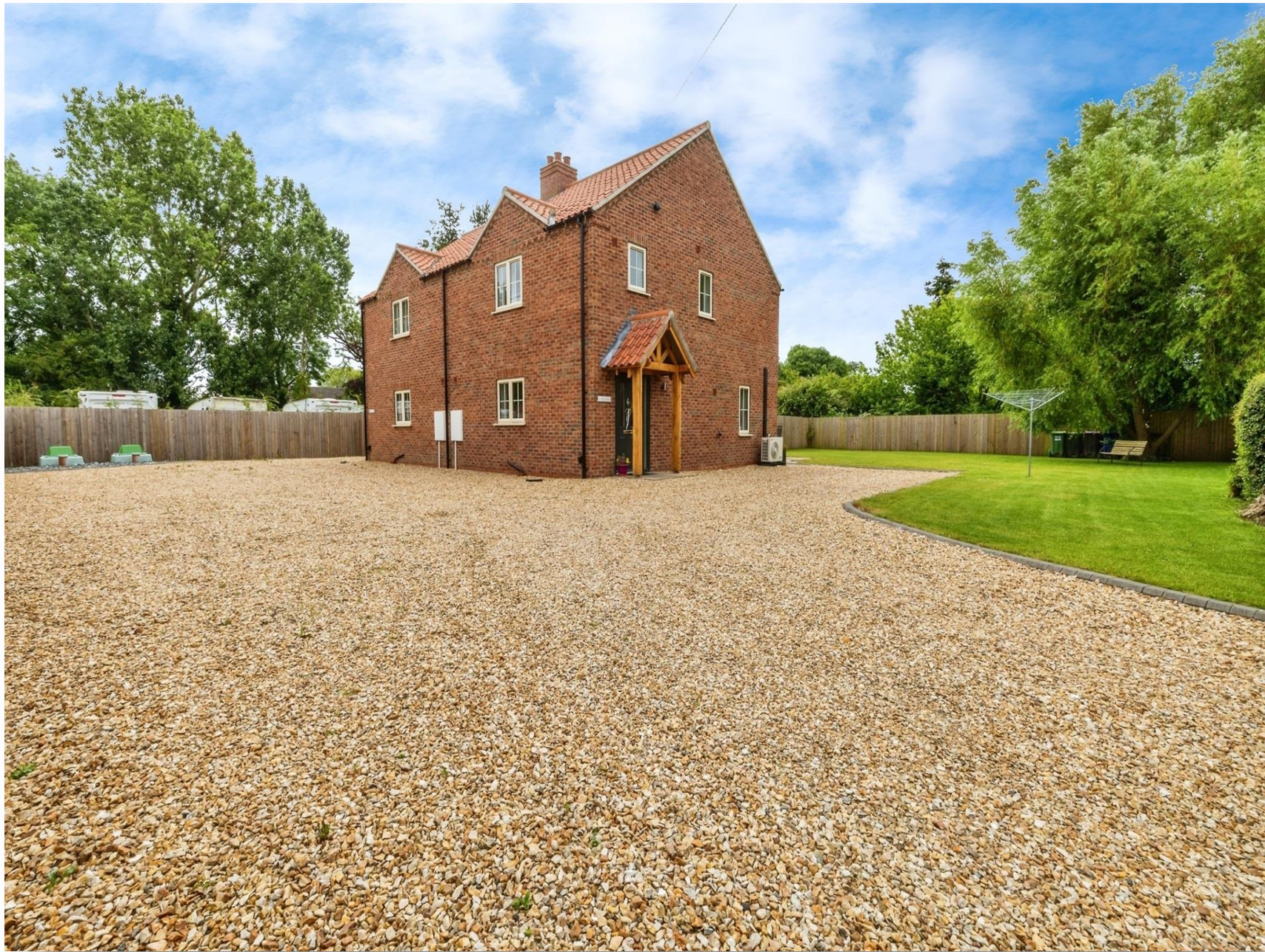
Willow House Station Road, Wickenby LINCOLN LN3 5AB