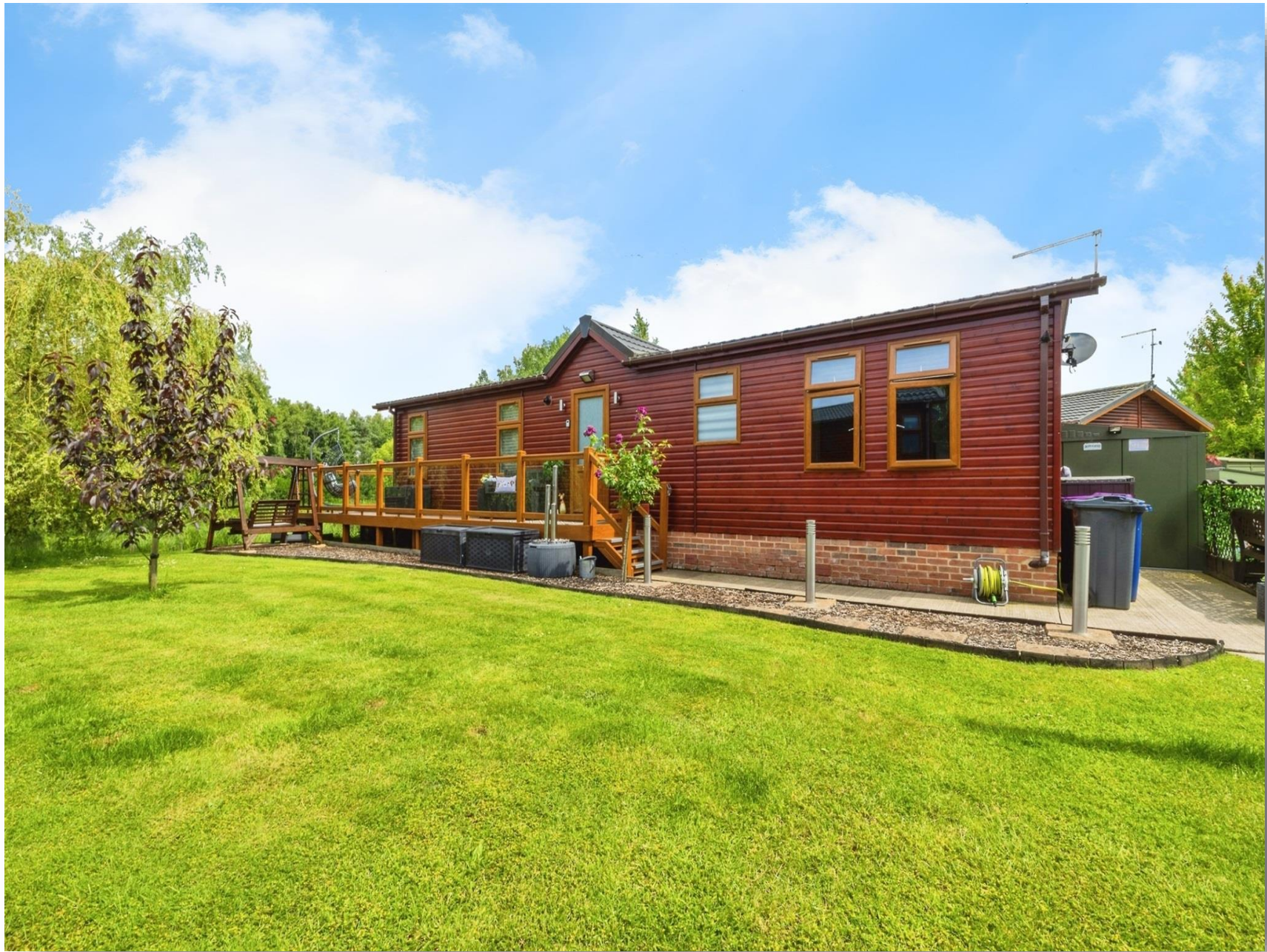
Burton Water Lodges Woodcock Lane, Lincoln LN1 2BE