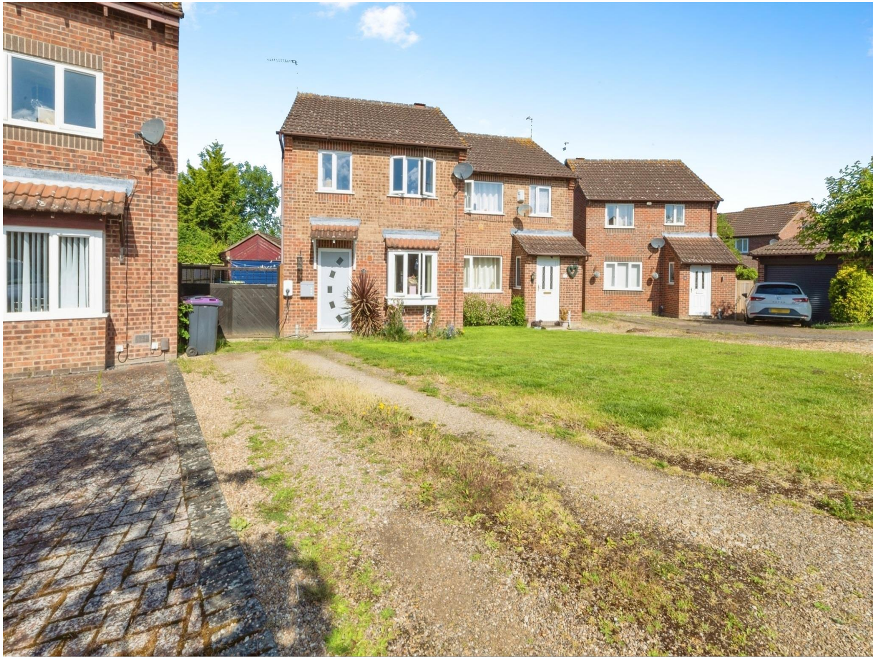
Adelaide Close, Waddington Lincoln LN5 9XN