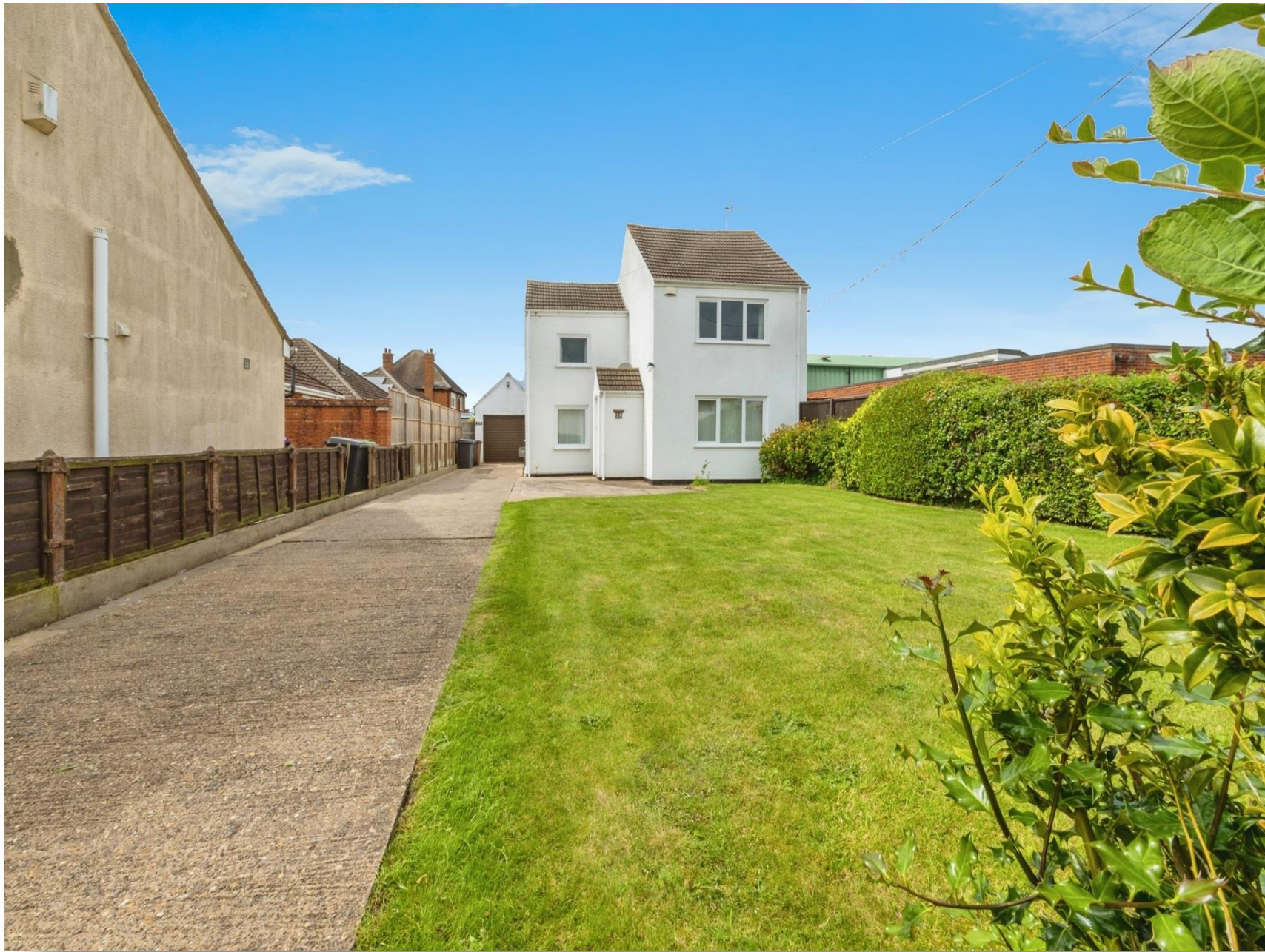
Middle Street, North Hykeham Lincoln LN6 9QX