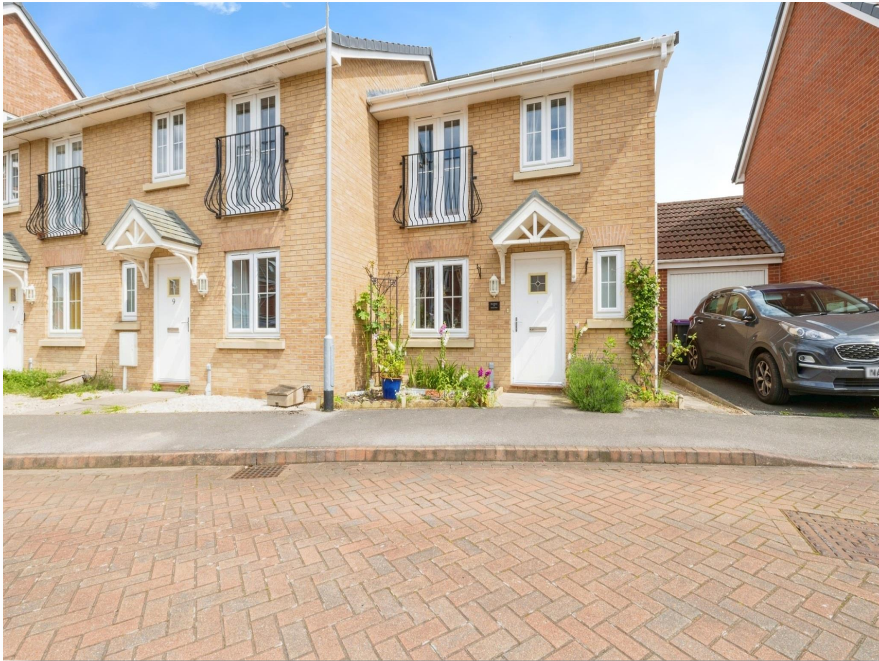
Quintus Place, North Hykeham LINCOLN LN6 9YS