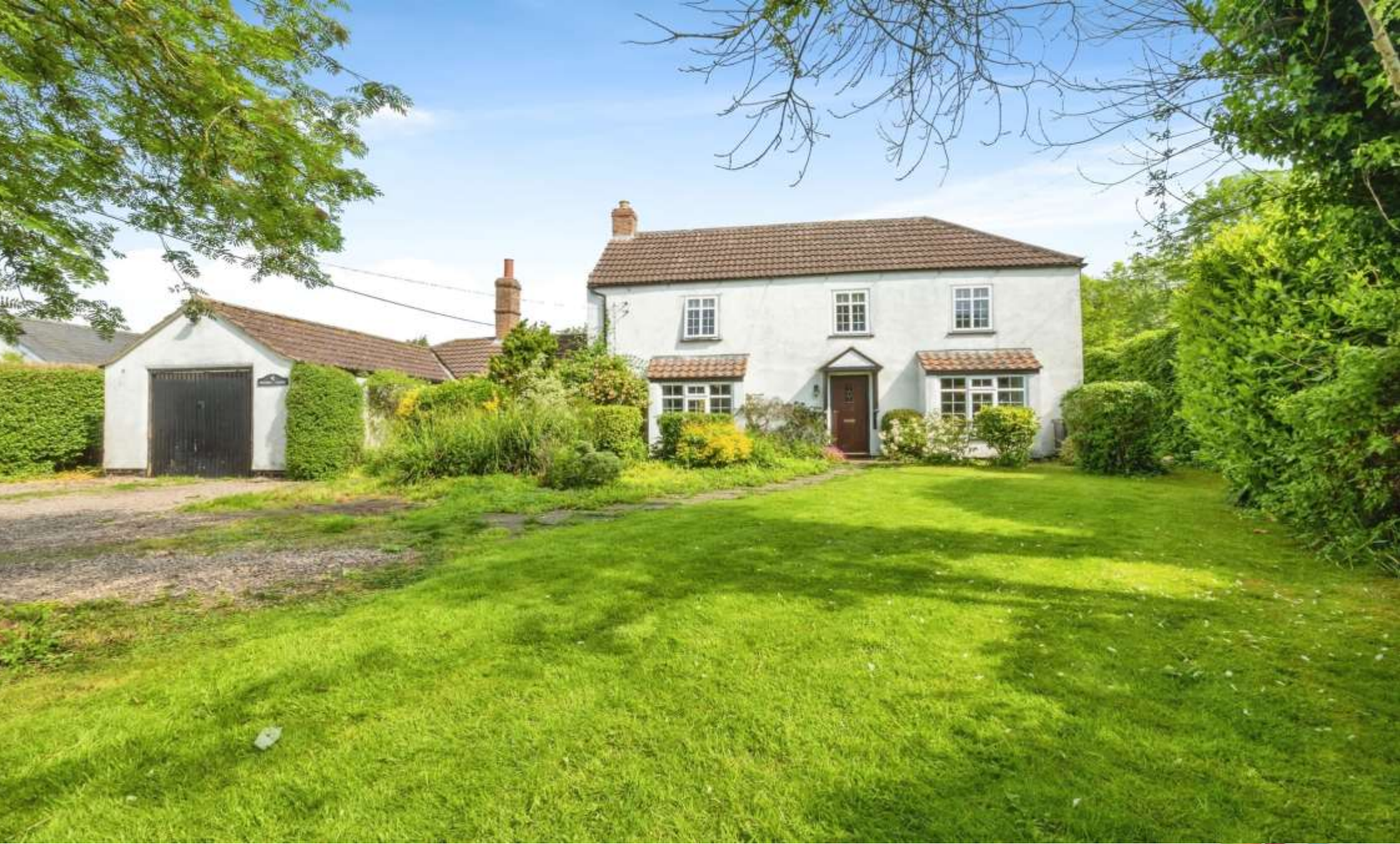
Ryecroft Cottage Main Road, Haltham Horncastle LN9 6JE