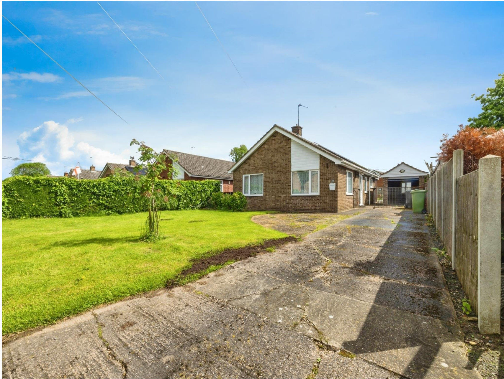
Stow Road, Willingham By Stow GAINSBOROUGH DN21 5LD