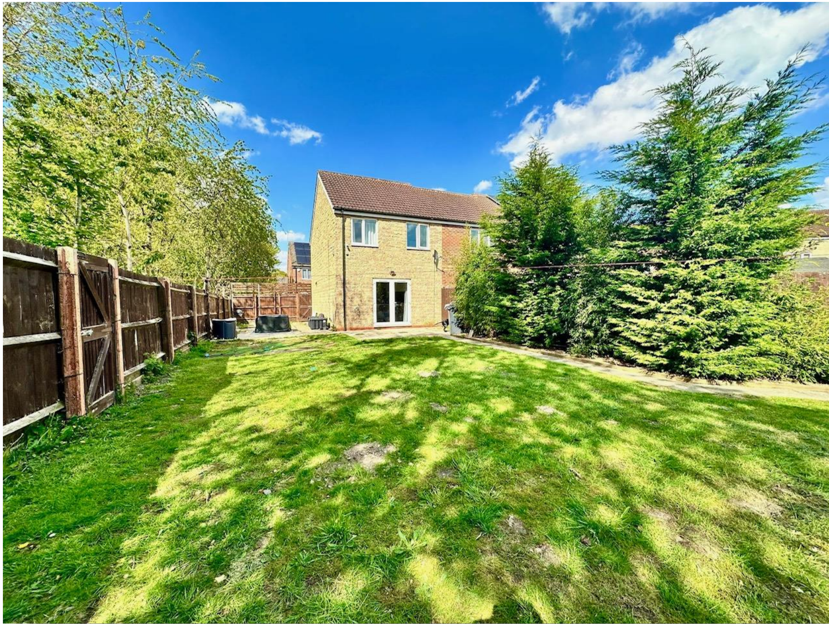
Ivywood Close, Lincoln LN6 0LG