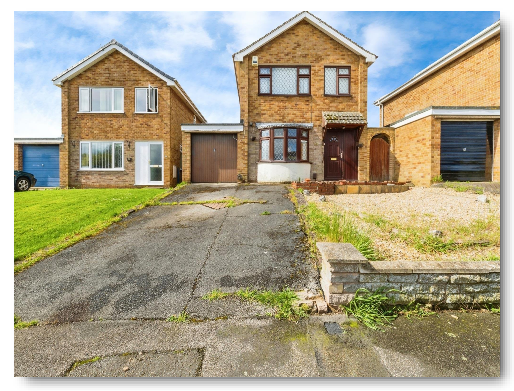
Fern Grove, Cherry Willingham Lincoln LN3 4BG