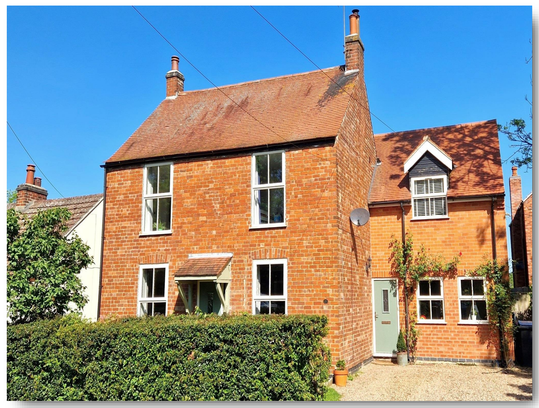
School Lane, North Scarle LINCOLN LN6 9EY