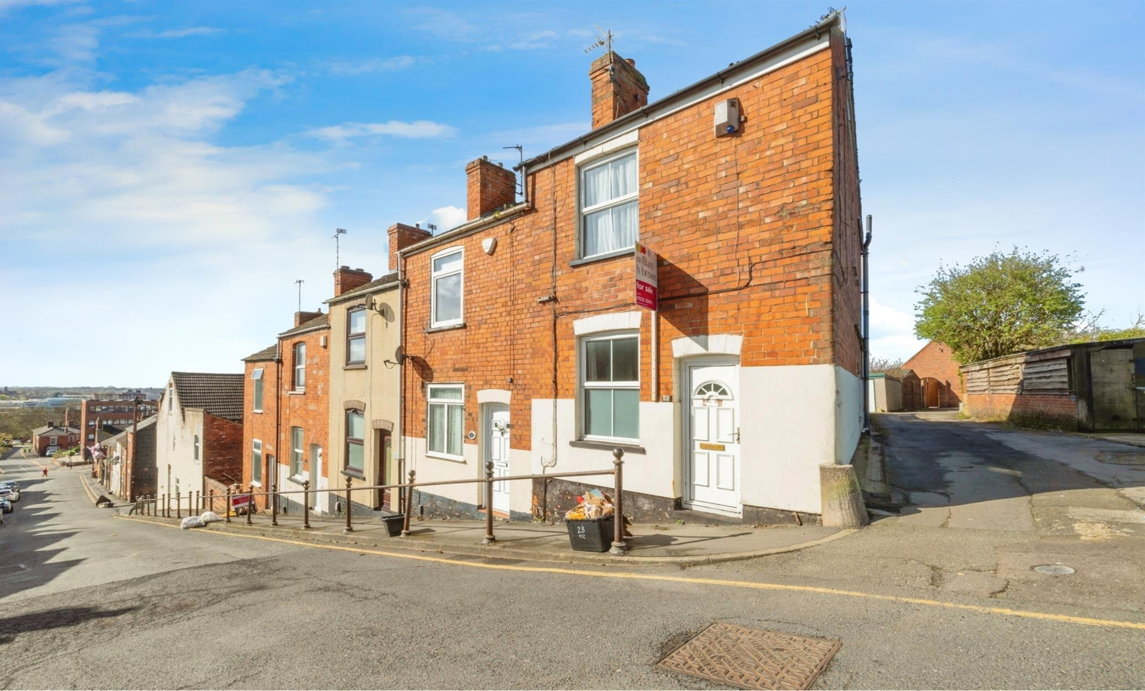
Victoria Street, West Parade Lincoln LN1 1HY