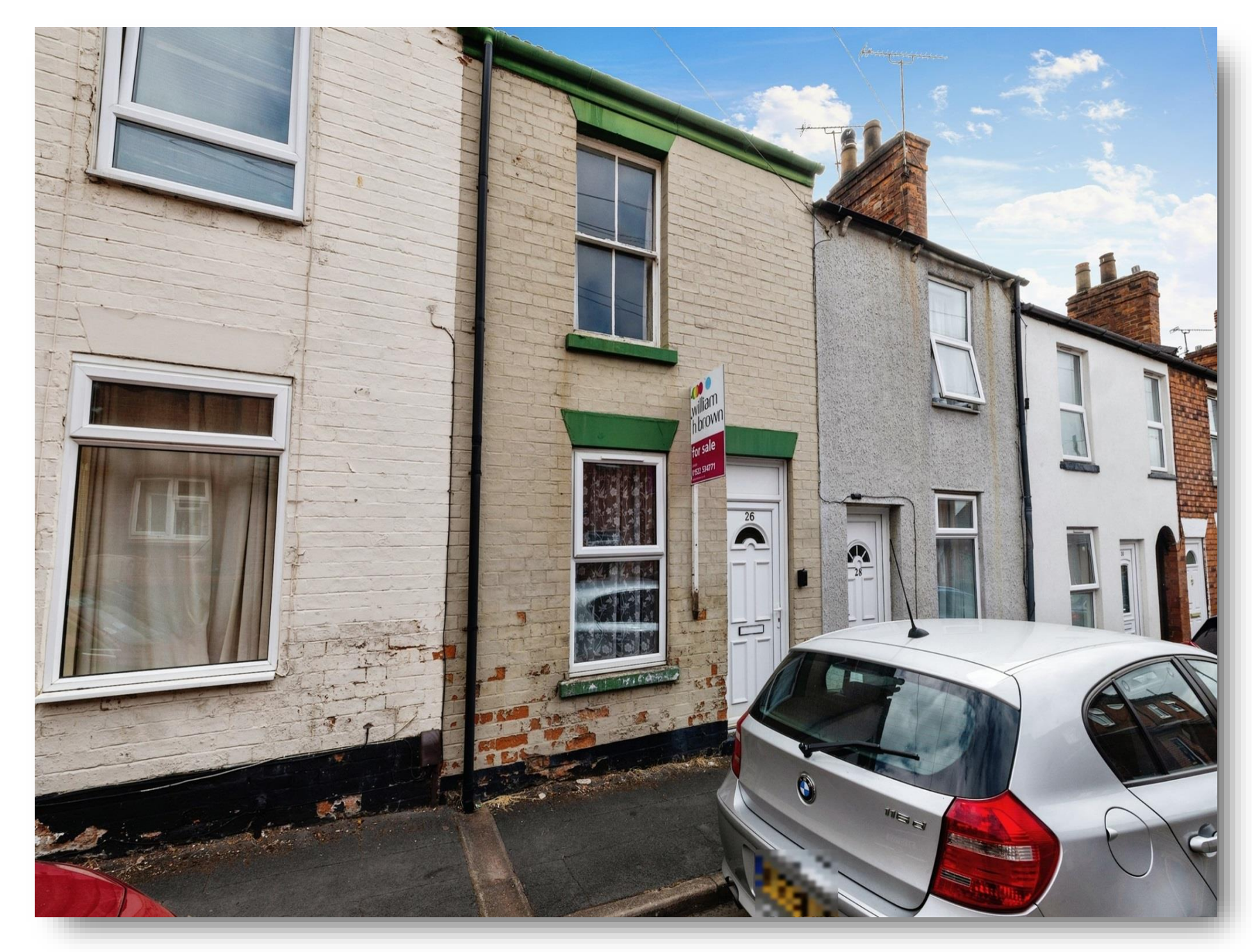
John Street, Lincoln LN2 5BH