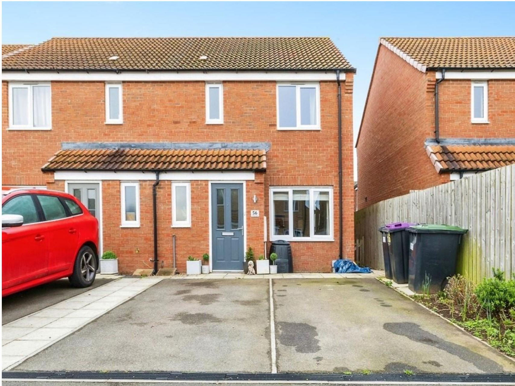
Cupola Close, North Hykeham Lincoln LN6 9ZP