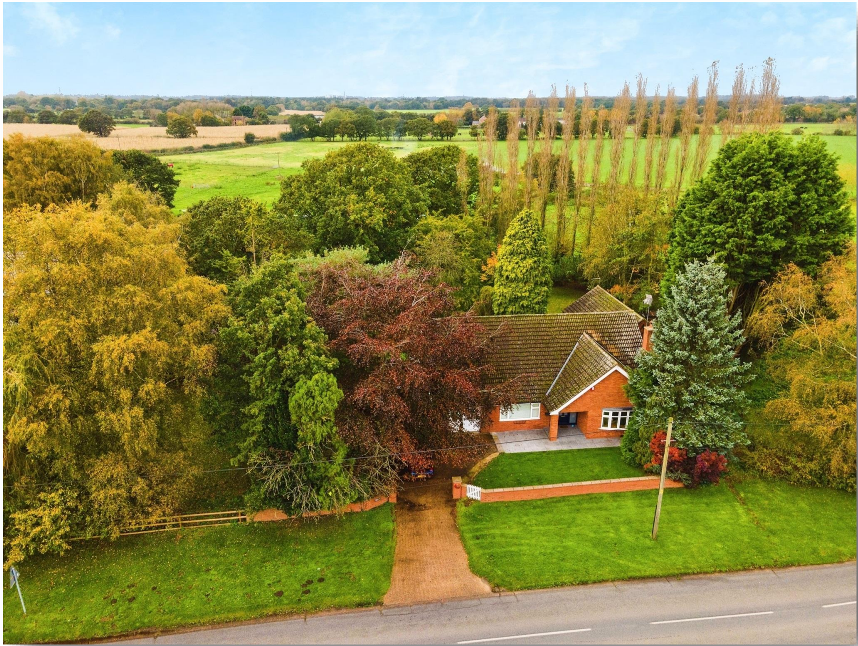
Inglenook Hives Lane, North Scarle LINCOLN LN6 9HA