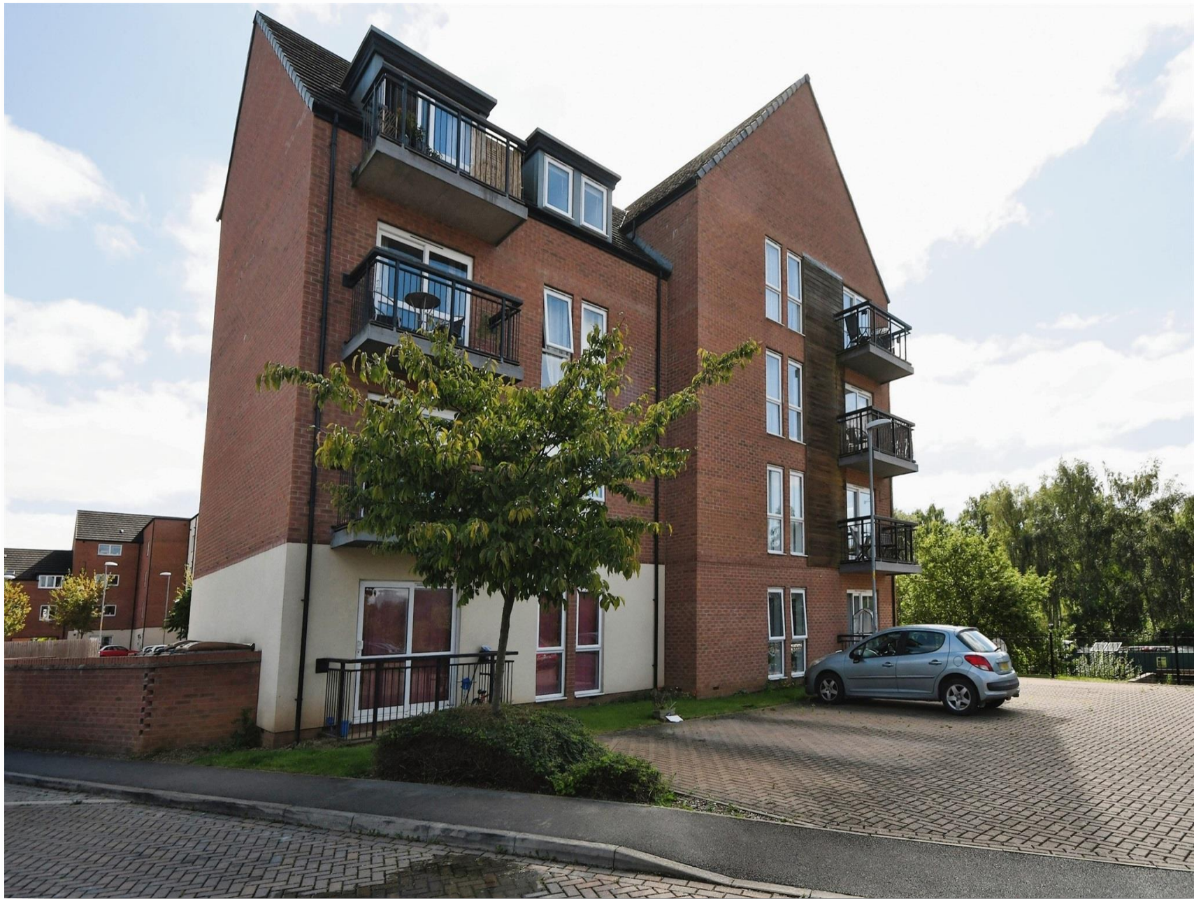
Angelica Road, Lincoln LN1 1BE