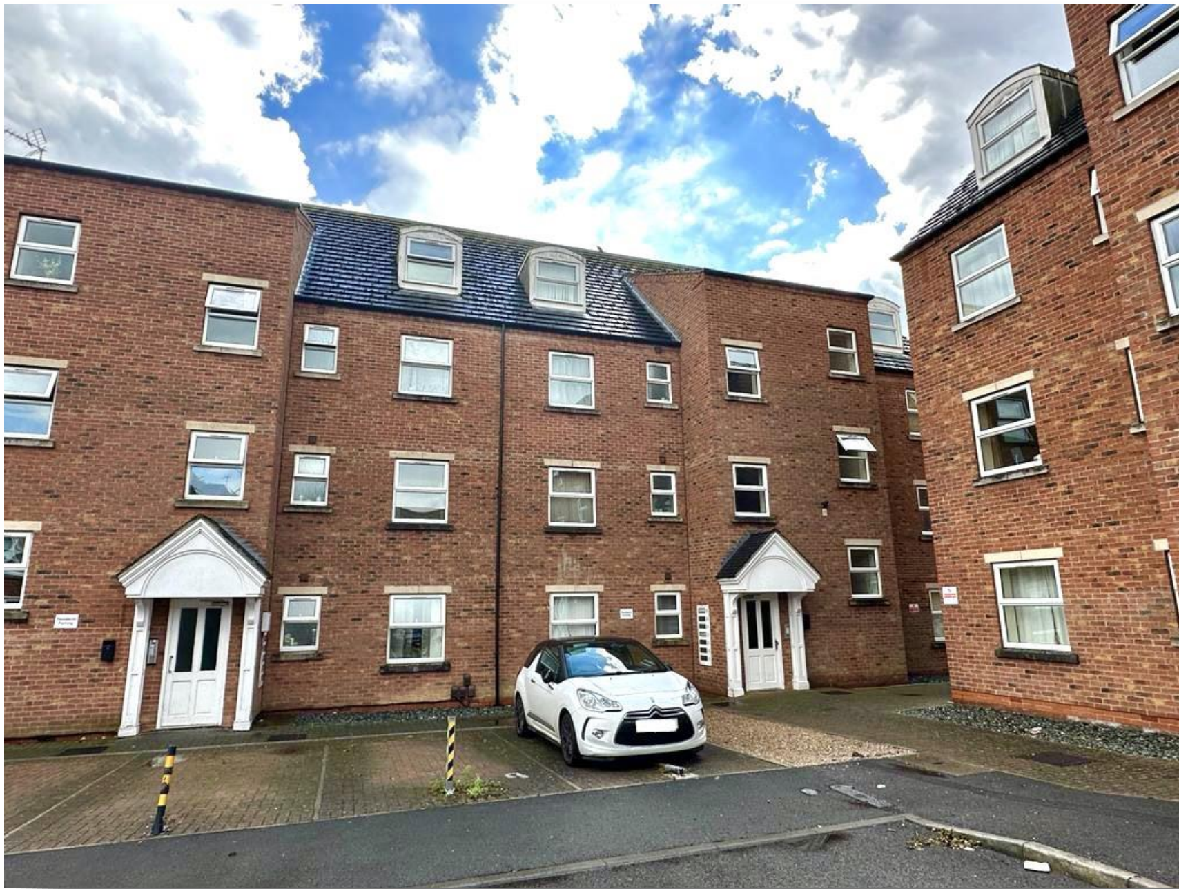
Willow Tree Close, Lincoln LN5 8NZ