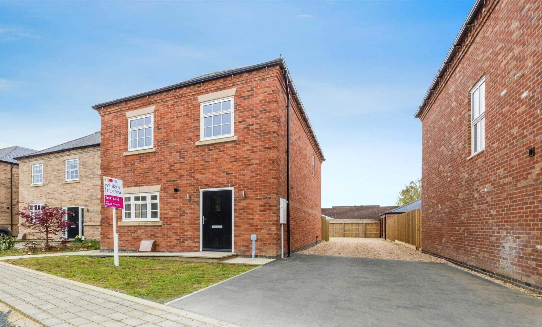
22 Medland Drive, Bracebridge Heath Lincoln LN4 2FS