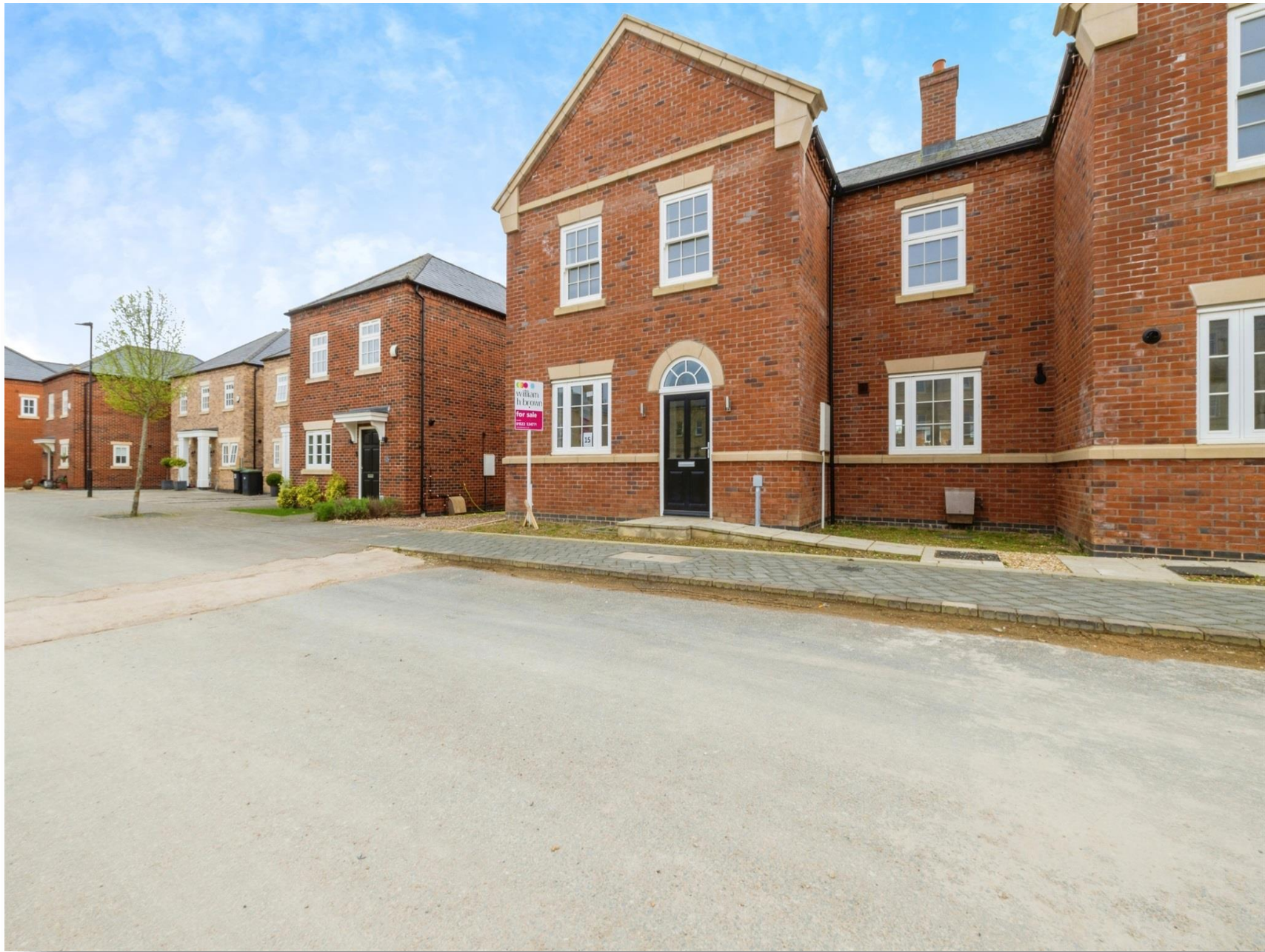
15 Medland Drive, Bracebridge Heath Lincoln LN4 2FS