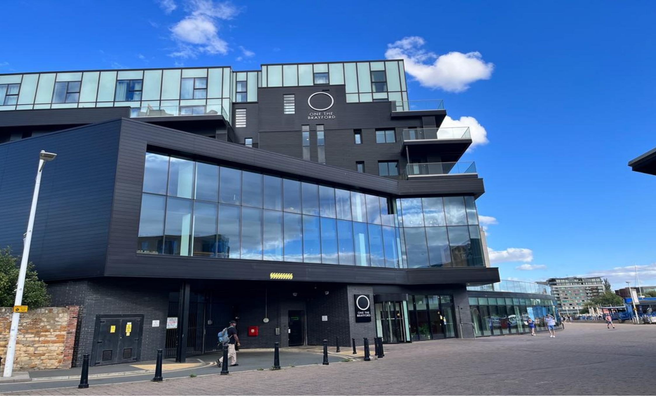
One The Brayford Brayford Wharf North, Lincoln LN1 1BN