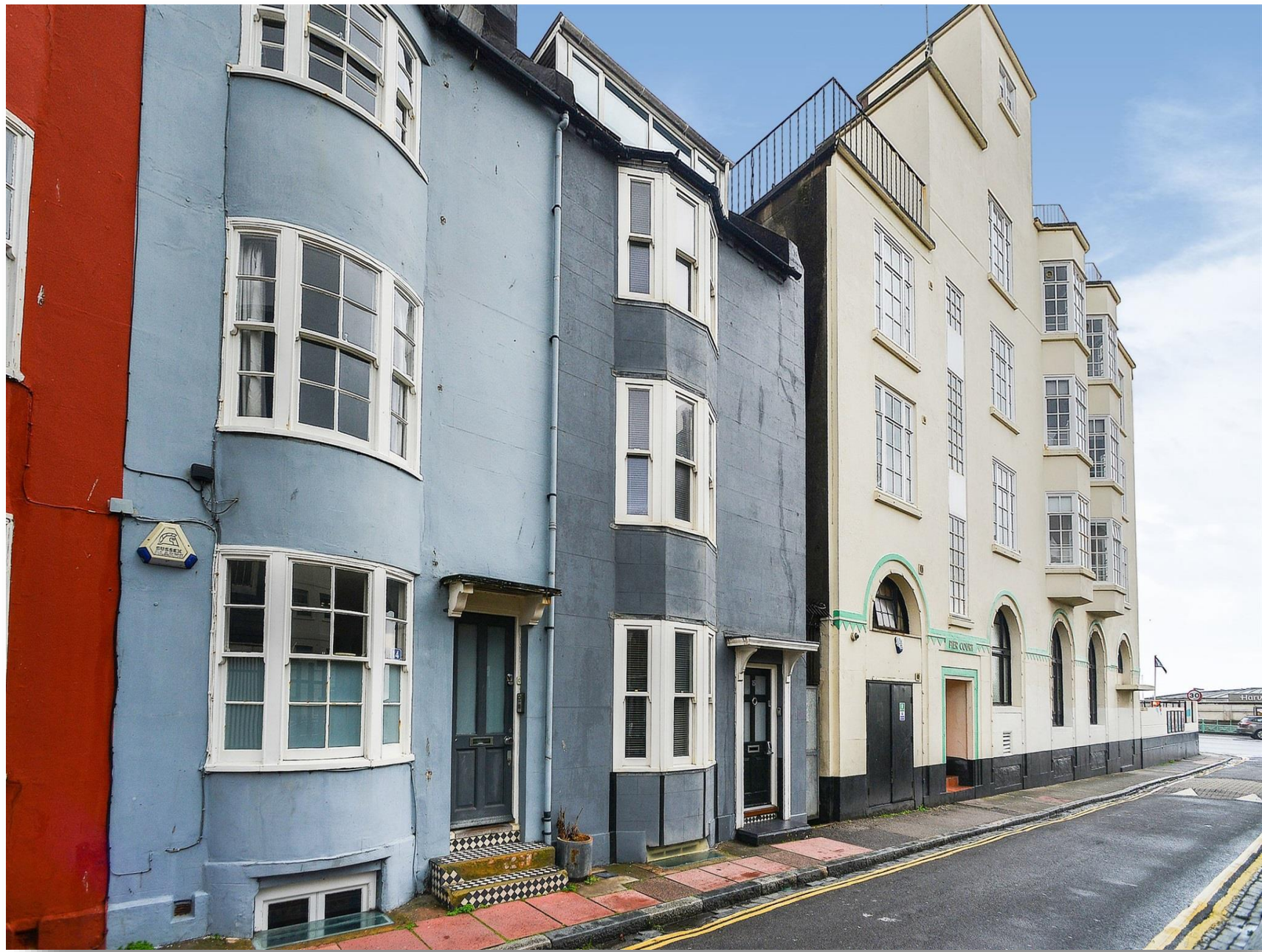
Charles Street, Brighton BN2 1TG