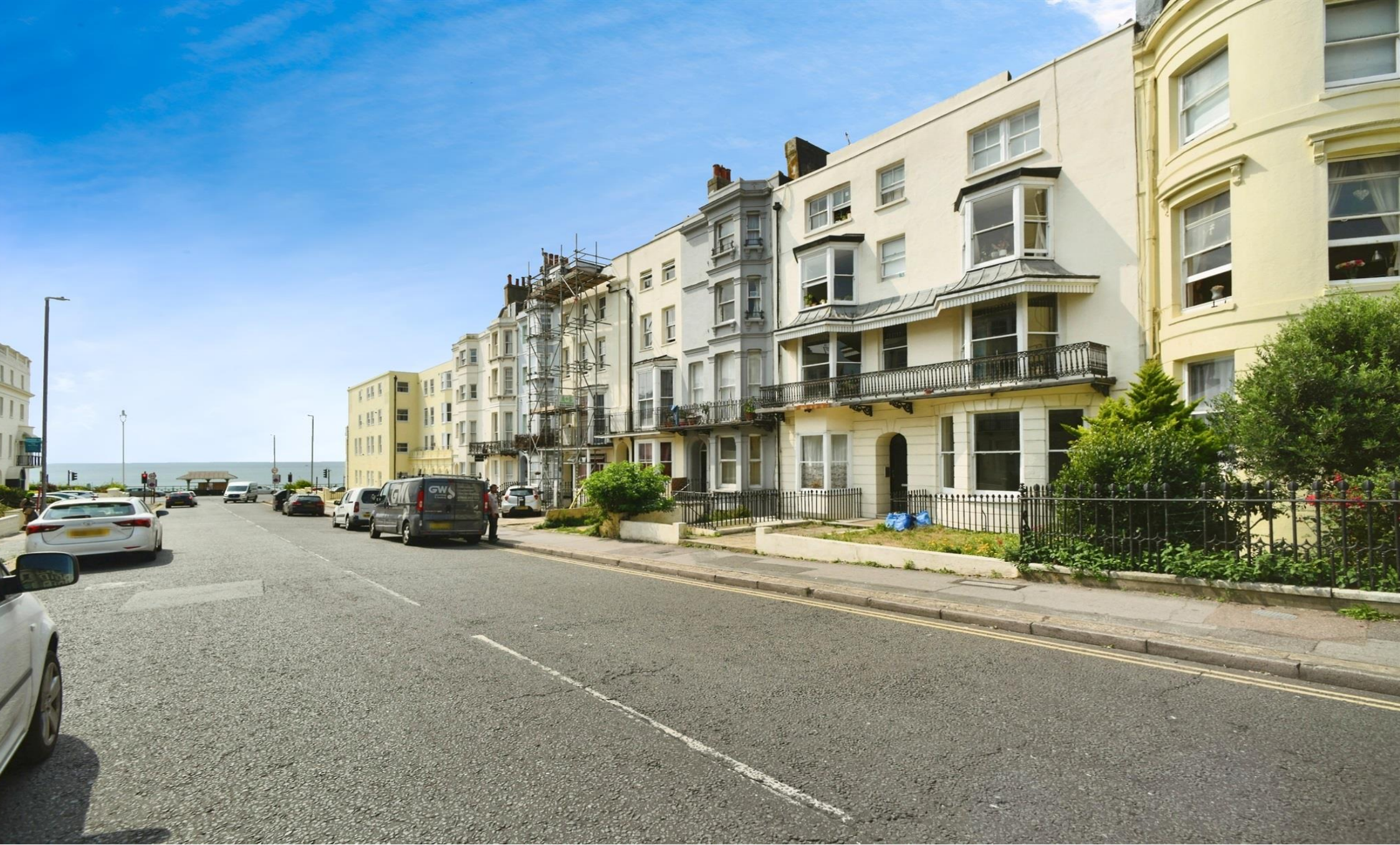
Lower Rock Gardens, Brighton BN2 1PG