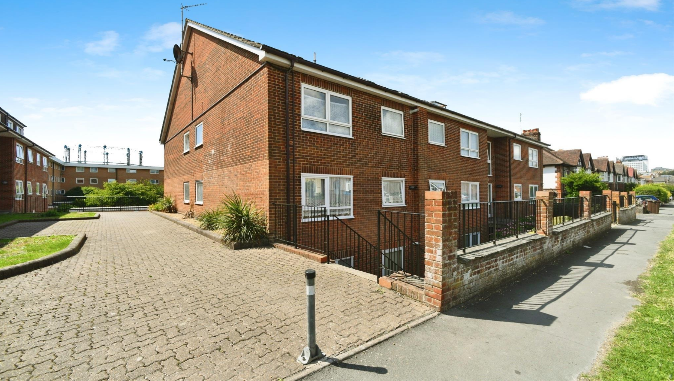
Henley Court Henley Road, Brighton BN2 5NA