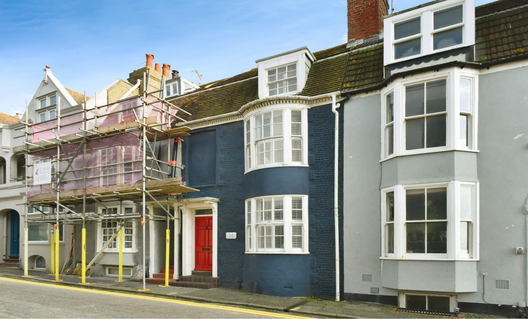
Camelford Street, Brighton BN2 1TQ