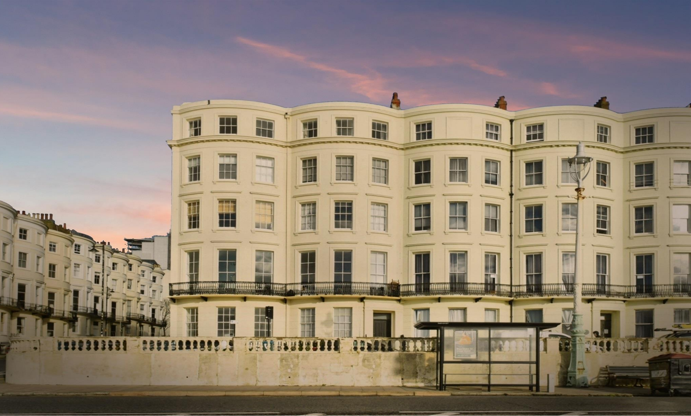
Percival Terrace, Brighton BN2 1FA