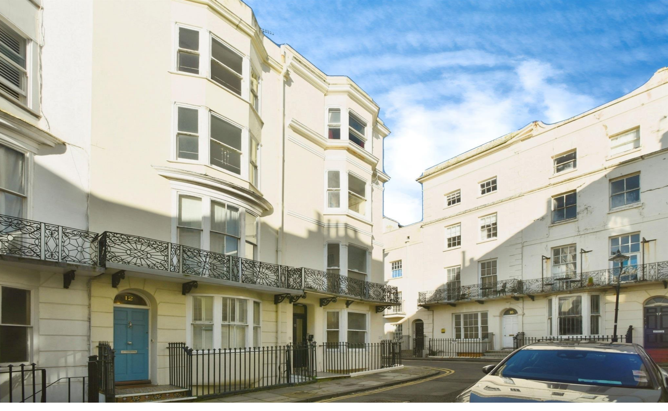
Bloomsbury Place, Brighton BN2 1DA