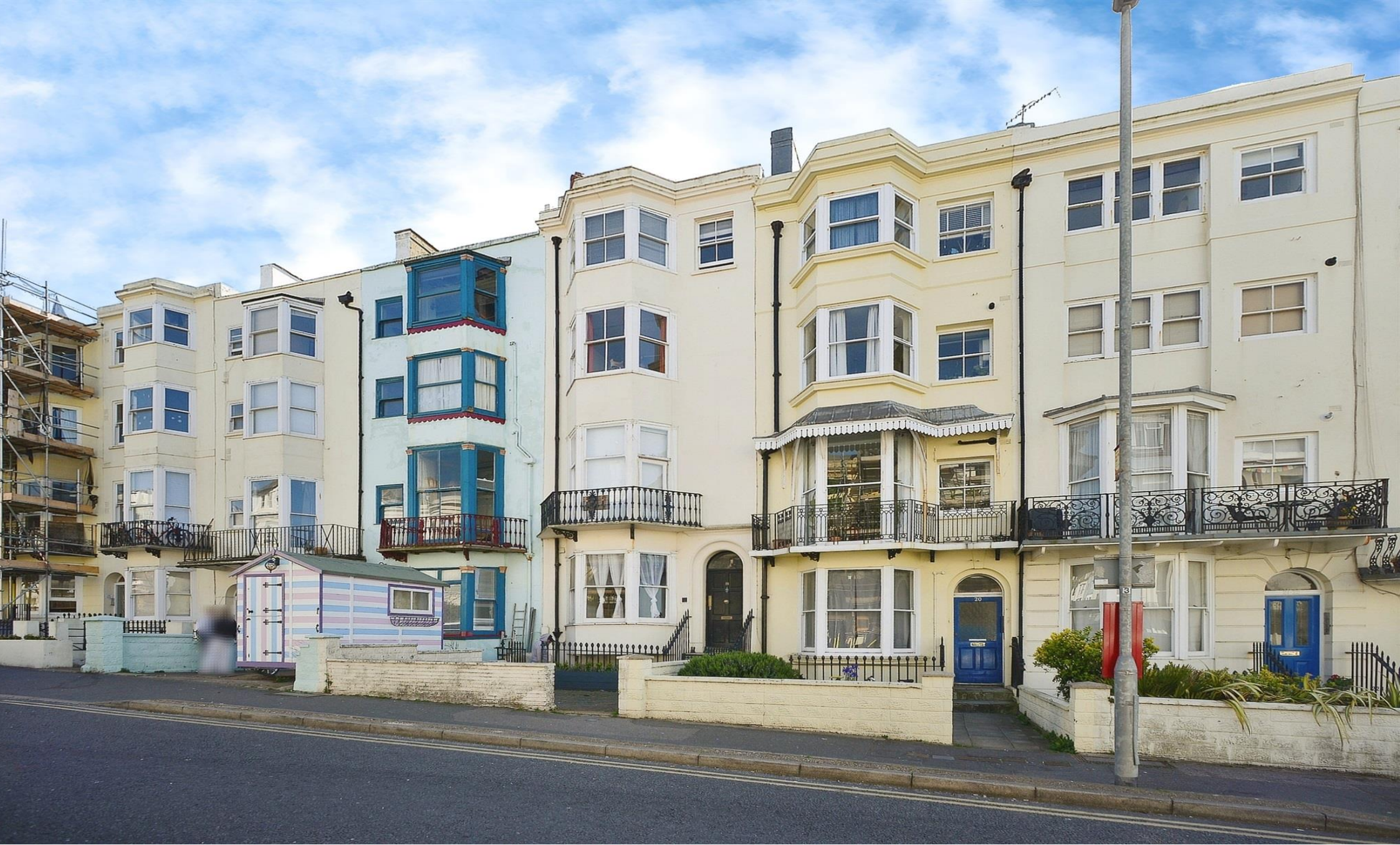
Lower Rock Gardens, Brighton BN2 1PG