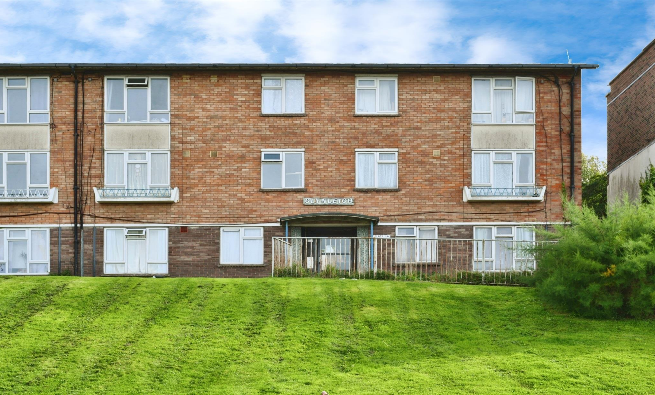
Glynleigh Ashton Rise, Brighton BN2 9RD