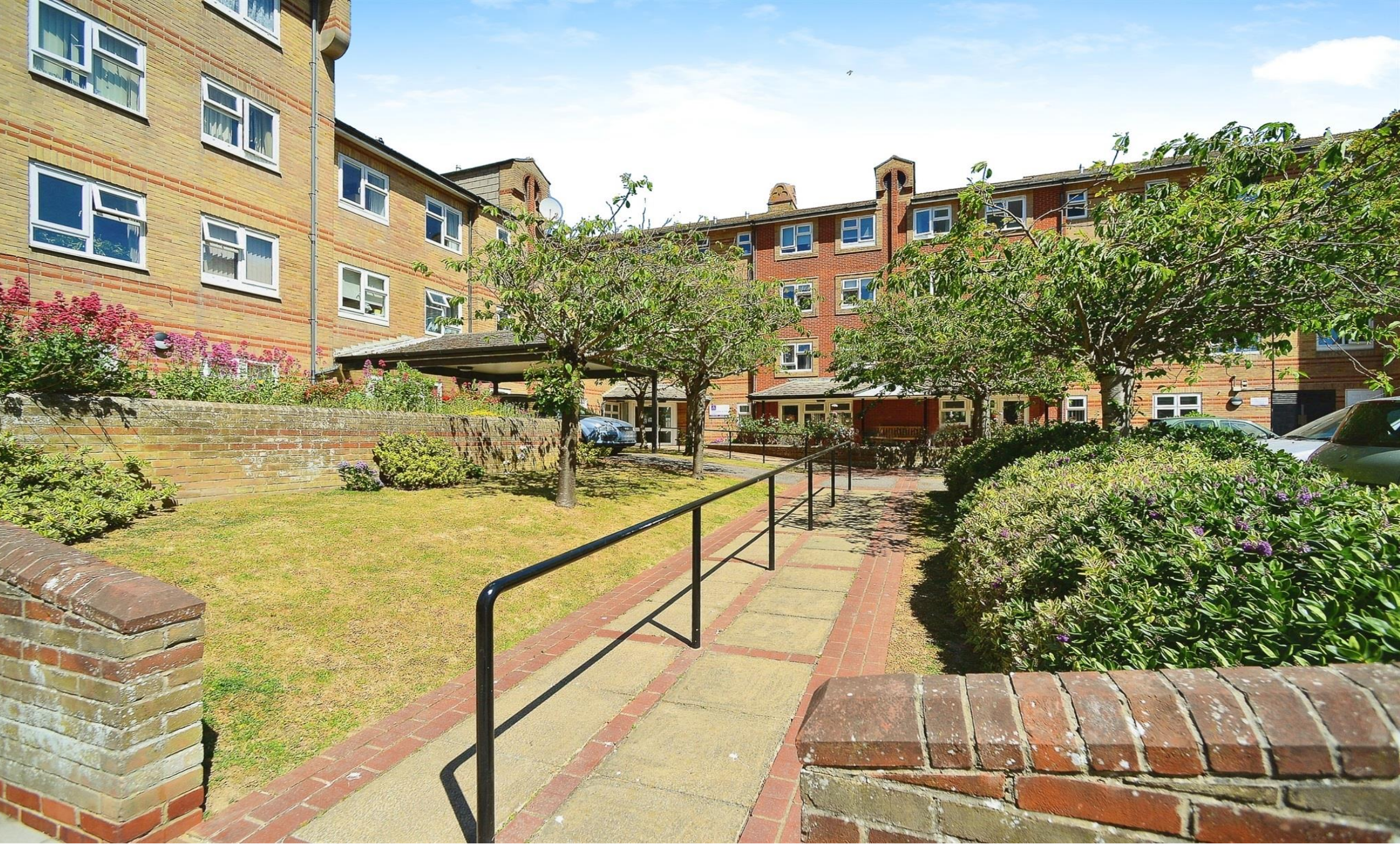
Jacqueline Du Pre Court Somerset Street, Brighton BN2 1HY