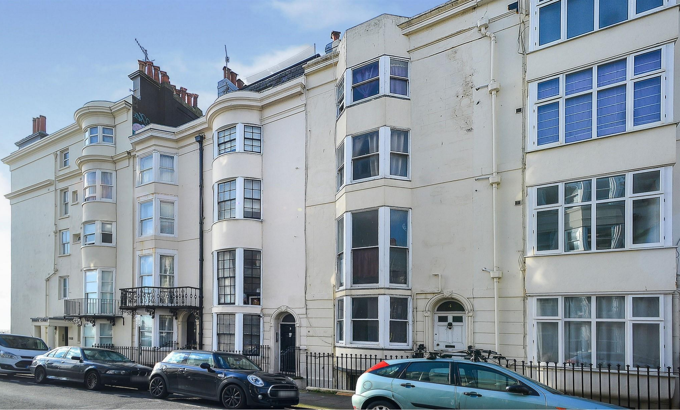
Madeira Place, Brighton BN2 1TN