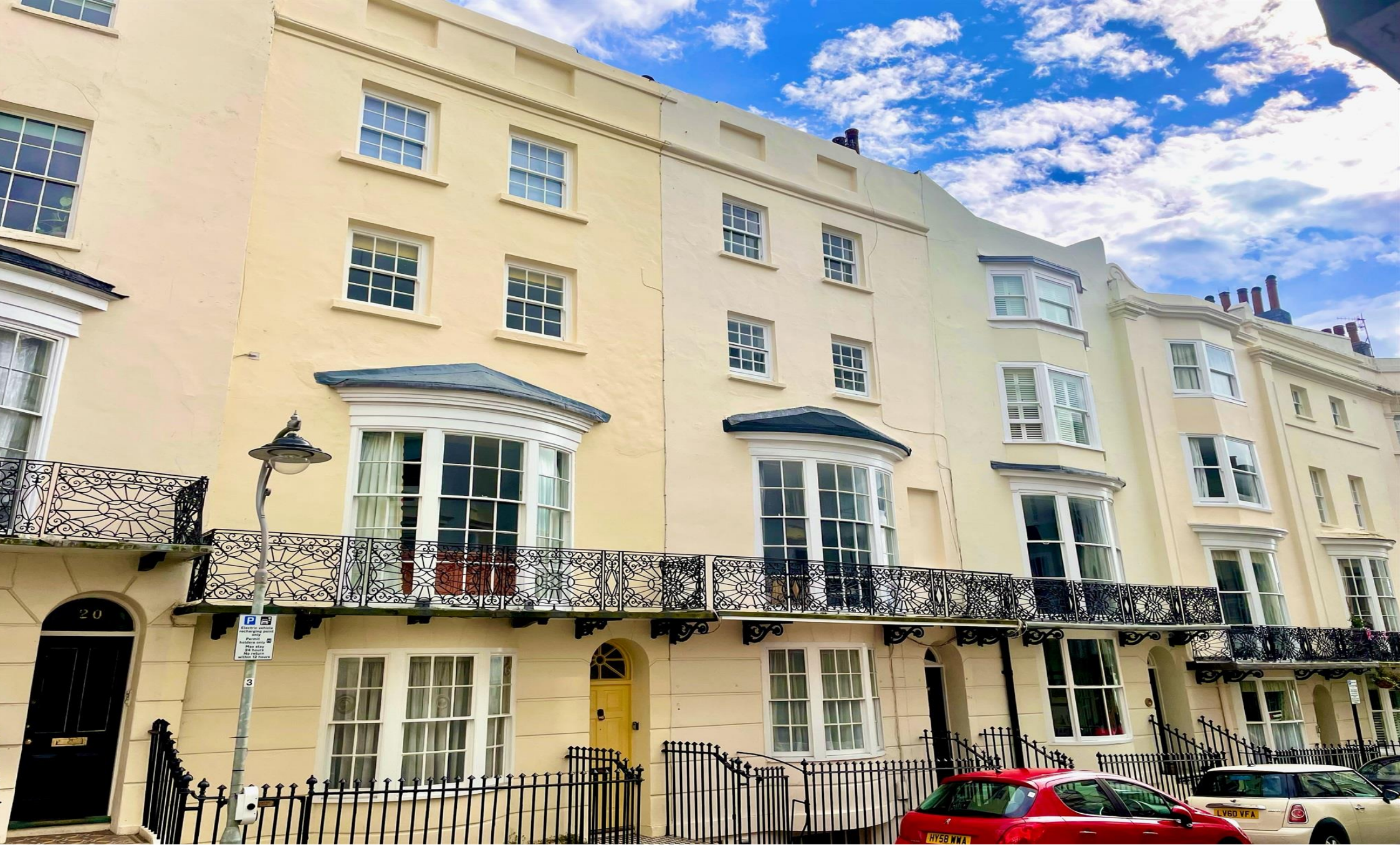
Bloomsbury Place, Brighton BN2 1DB