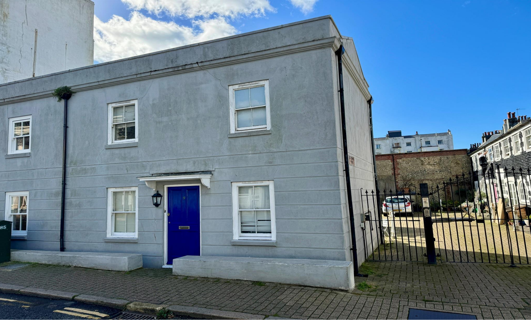
St. Johns Mews, Brighton BN2 1BD