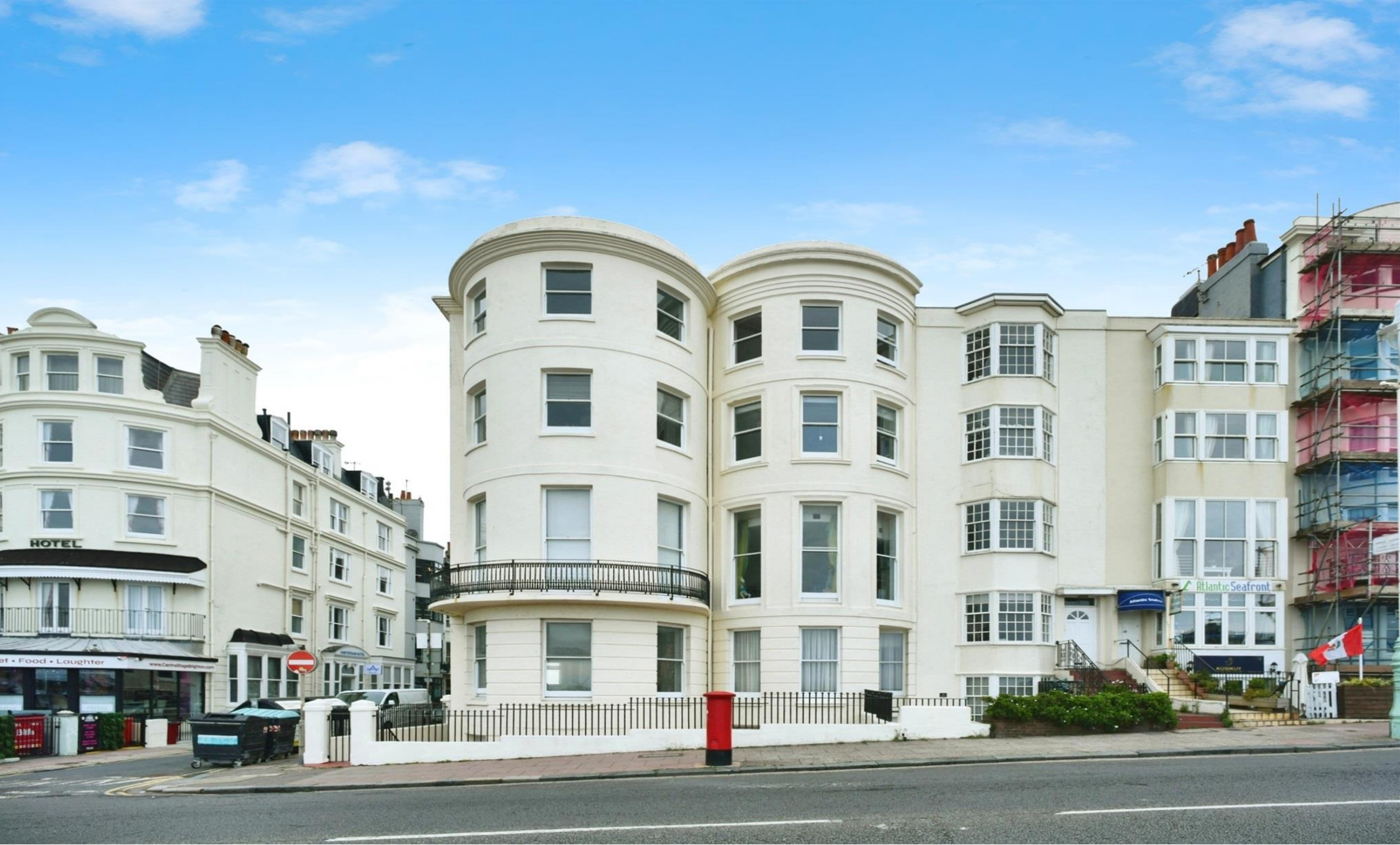
Marine House Marine Parade, Brighton BN2 1TL