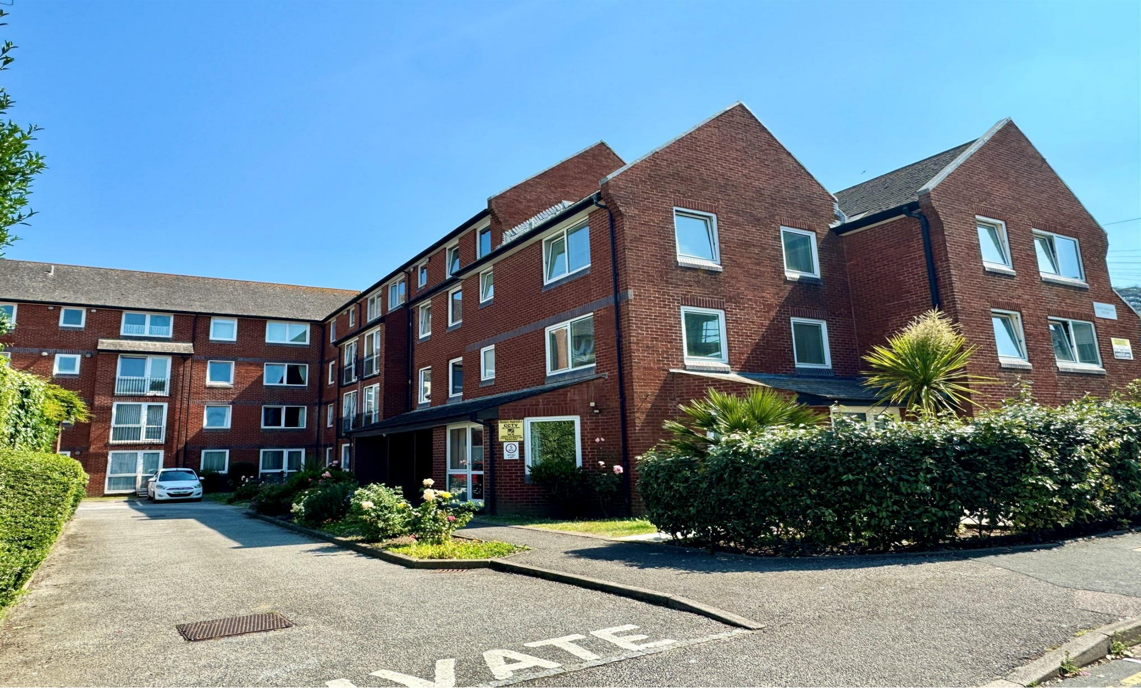
Danny Sheldon House Eastern Road, Brighton BN2 1JQ