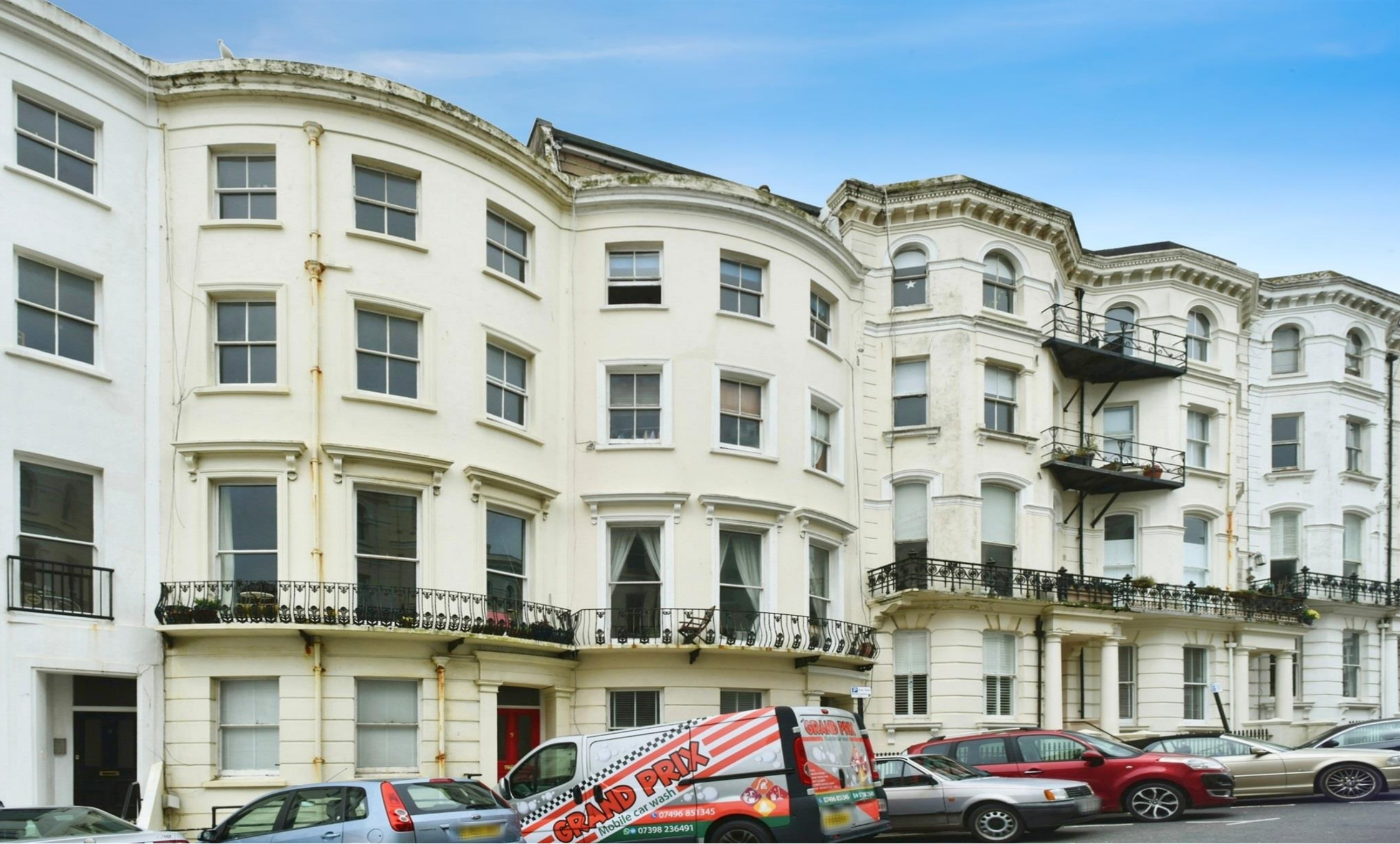
Chesham Place, Brighton BN2 1FB