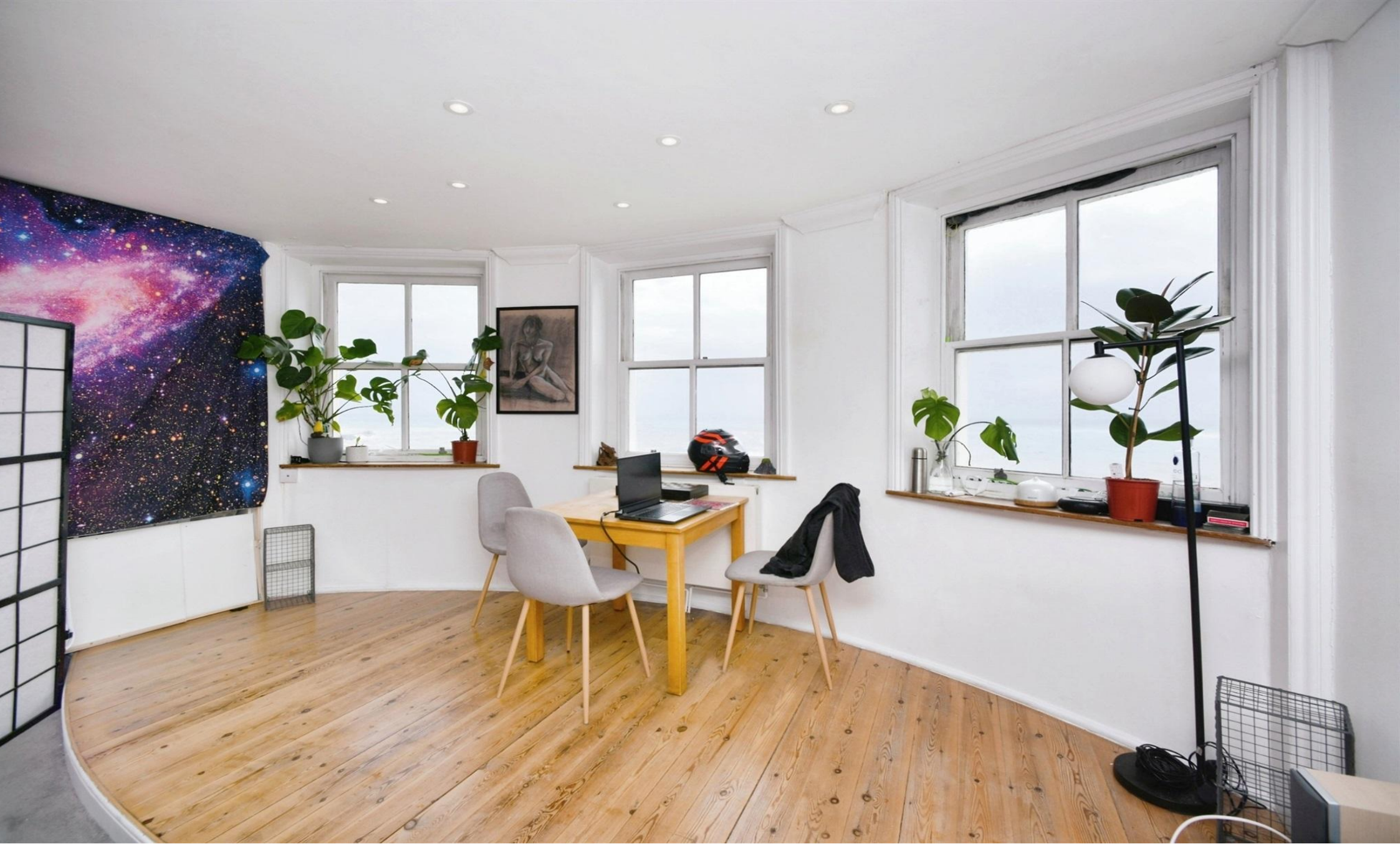
Clarendon Terrace, Brighton BN2 1FD