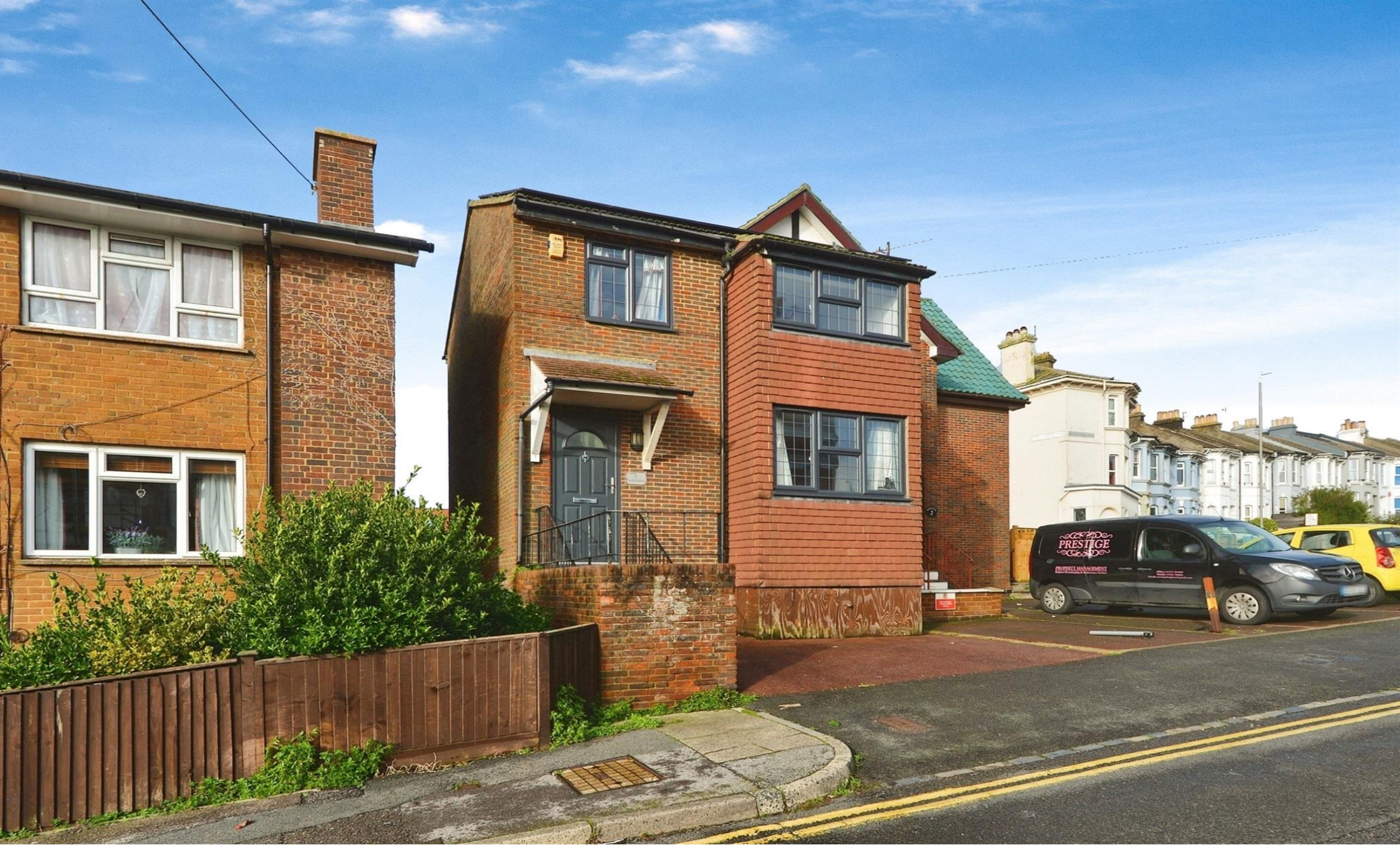
Parks View Upper Park Place, Brighton BN2 0GU