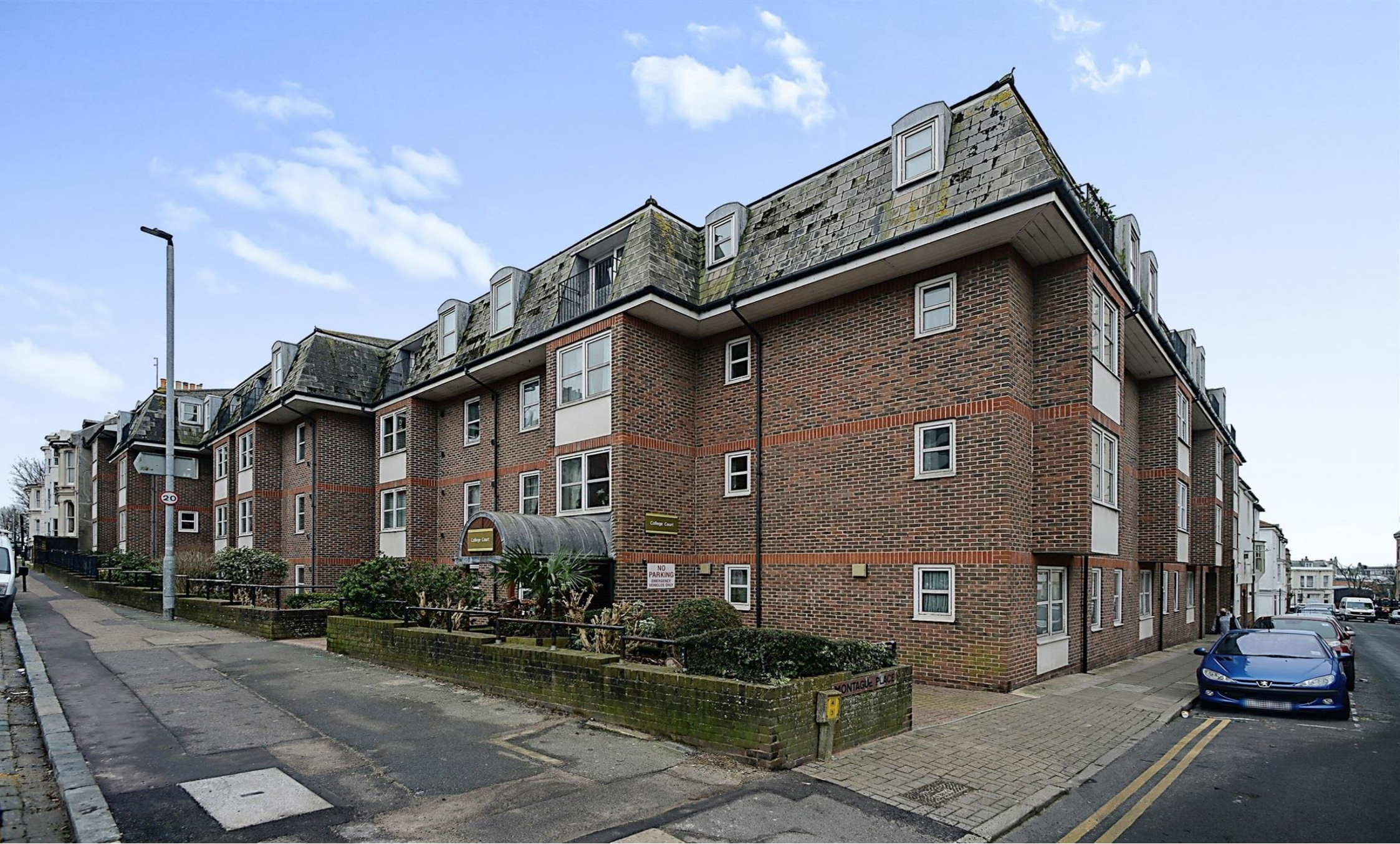
College Court Eastern Road, Brighton BN2 0BF