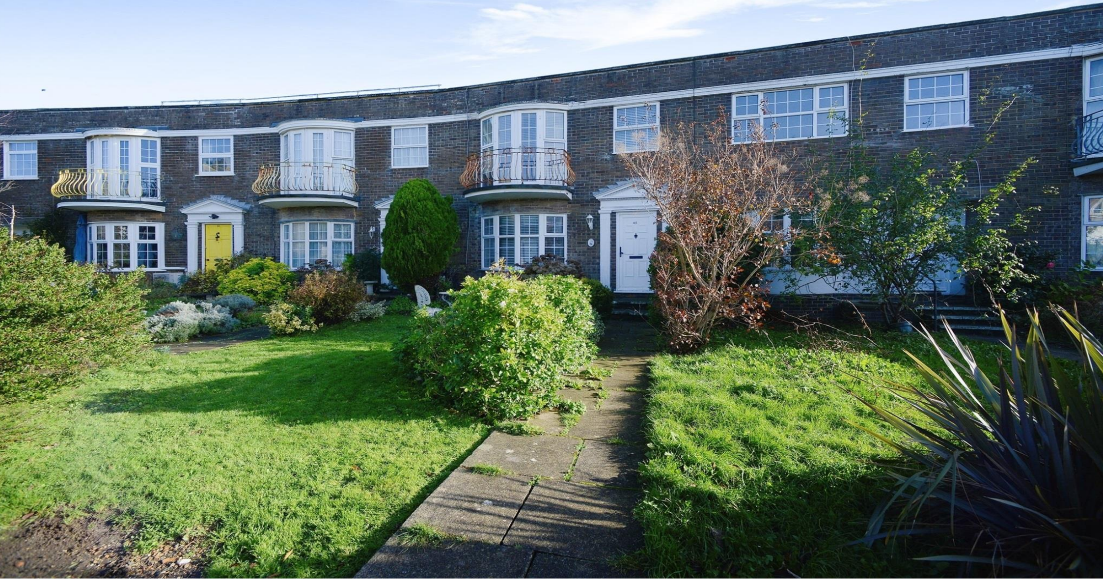
Prince Regents Close, Brighton BN2 5JP