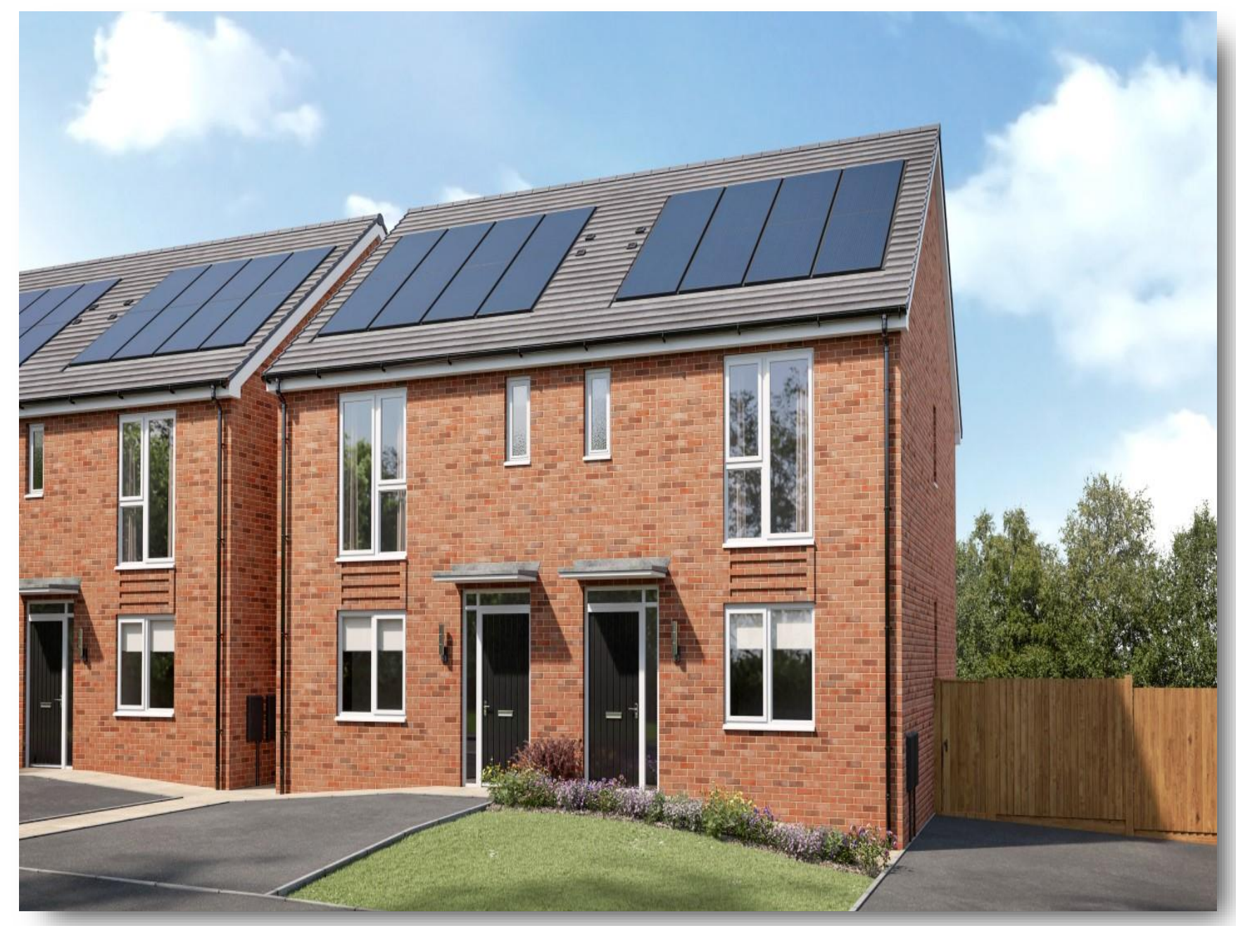
The Houghton Chiswell Drive, Coalville LE67 3JX