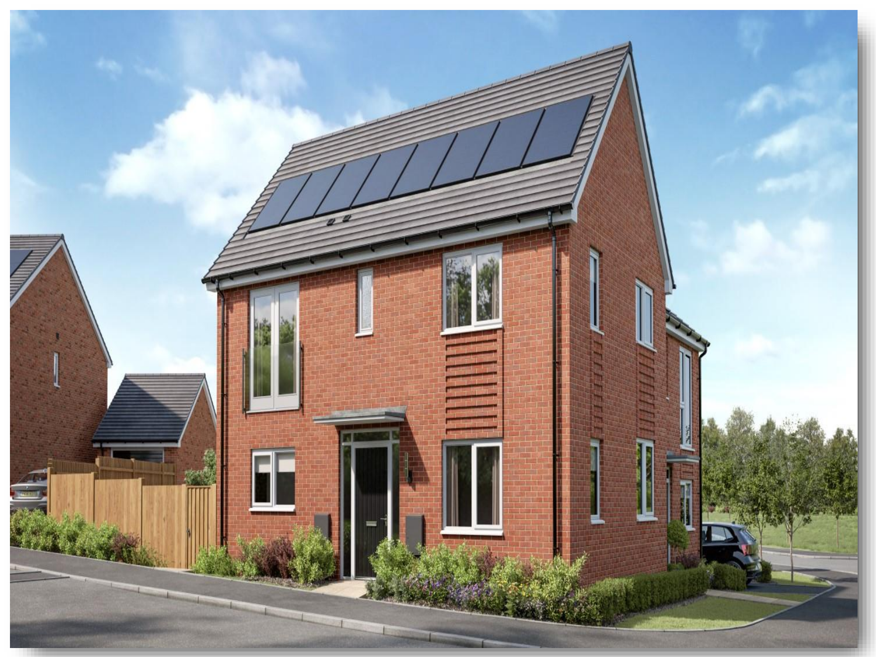
The Webster Chiswell Drive, Coalville LE67 3JX